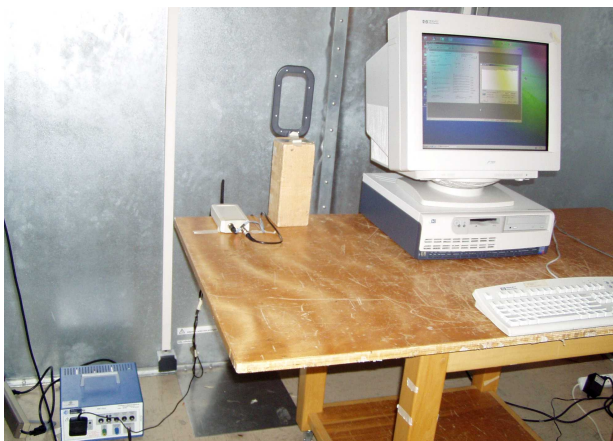
Front view (TR-HA1)