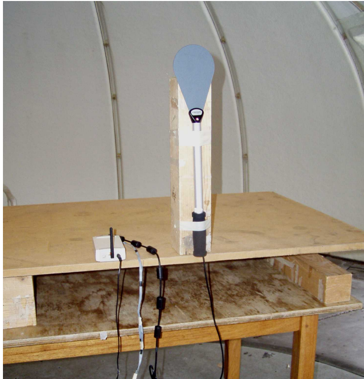
L-W1 antenna, WIFI mode