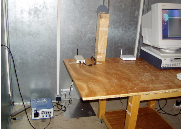
Front view (L-W1, Wifi mode)