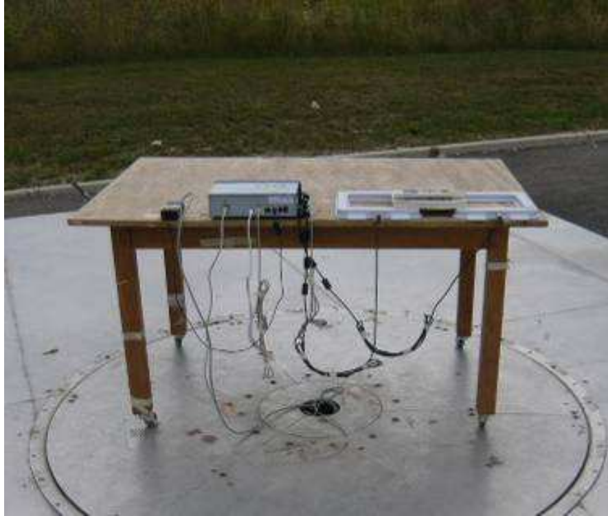
General views, the same for both power supplies