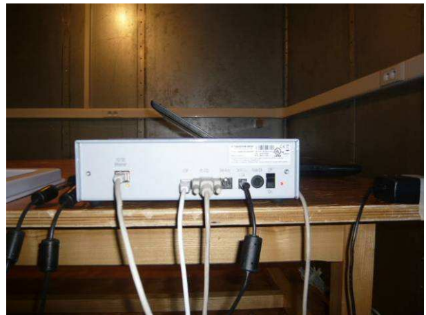
Detail views, the same for both power supplies