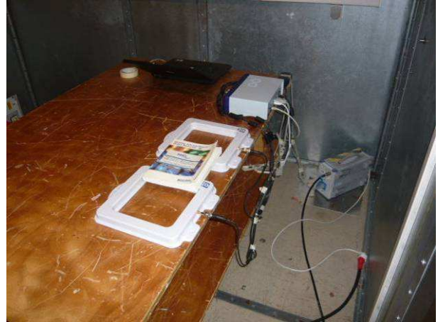
General views, the same for both power supplies