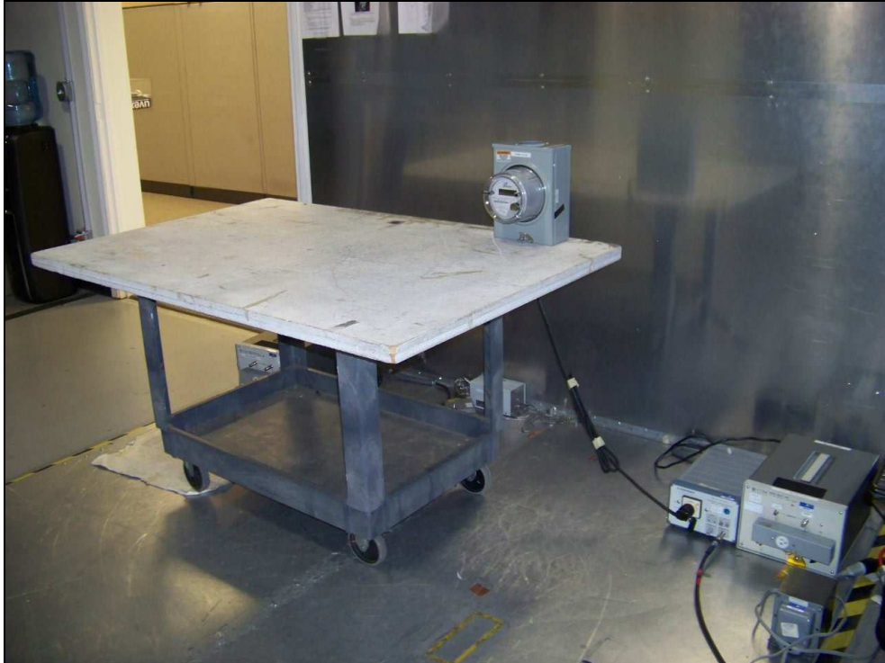
Figure 10: Conducted Emissions – 2S Meter