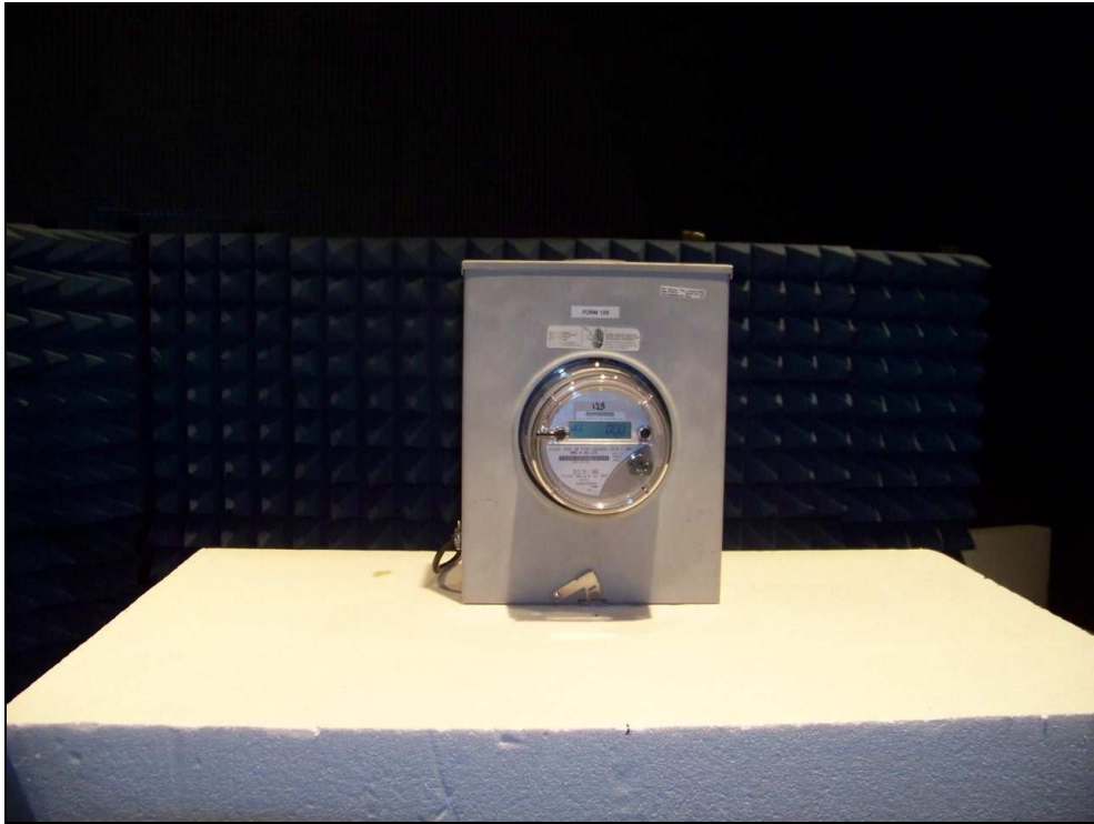
Figure 5: Radiated Emissions – 12S Meter