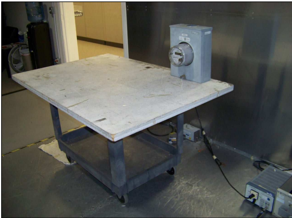
Figure 12: Conducted Emissions – 12S Meter