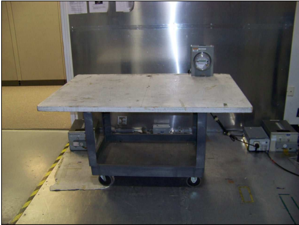
Figure 7: Conducted Emissions – 1S Meter