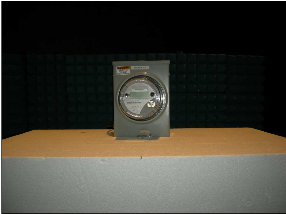
Figure 1: Radiated Emissions – 1S Meter