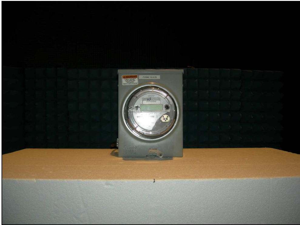
Figure 3: Radiated Emissions – 2S Meter