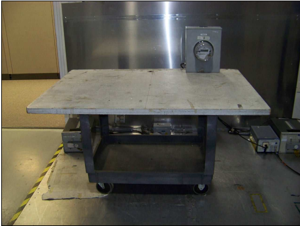
Figure 11: Conducted Emissions – 12S Meter