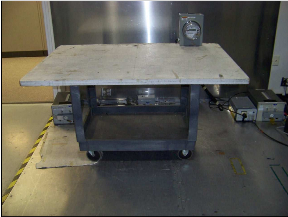
Figure 9: Conducted Emissions – 2S Meter