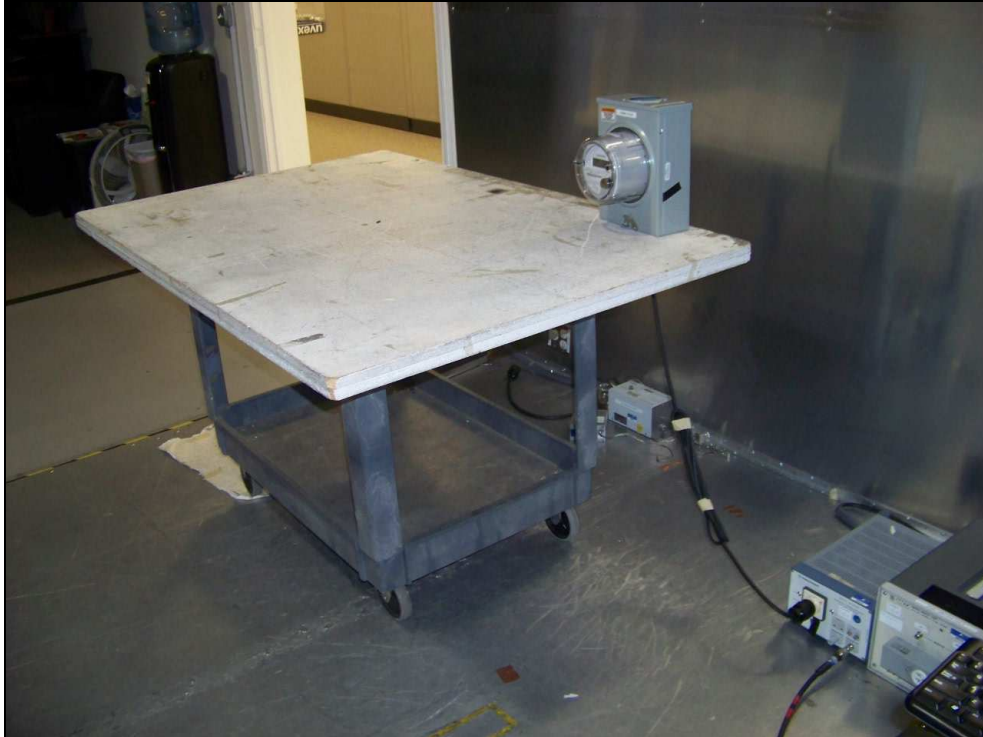
Figure 8: Conducted Emissions – 1S Meter