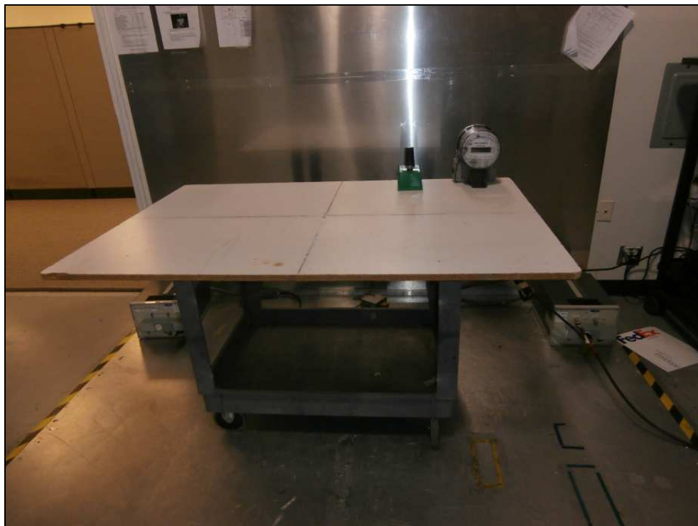
Figure 9: Conducted Emissions – 12S Meter Form – CDMA Modem External Antenna Option