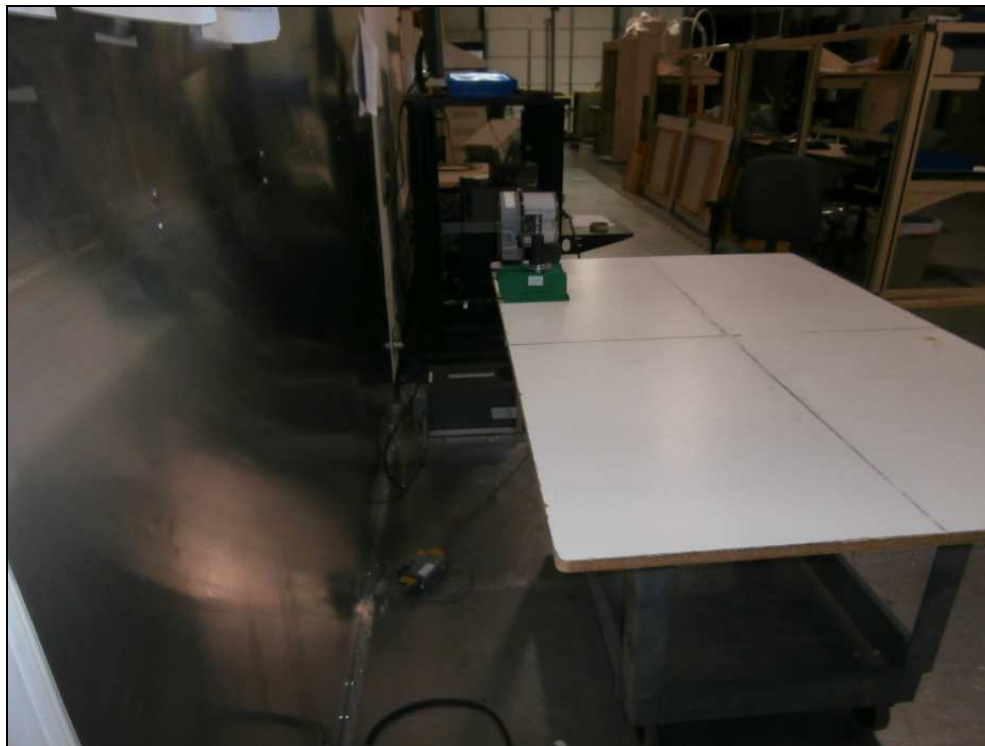
Figure 14: Conducted Emissions – 45S Meter Form – CDMA Modem External Antenna Option