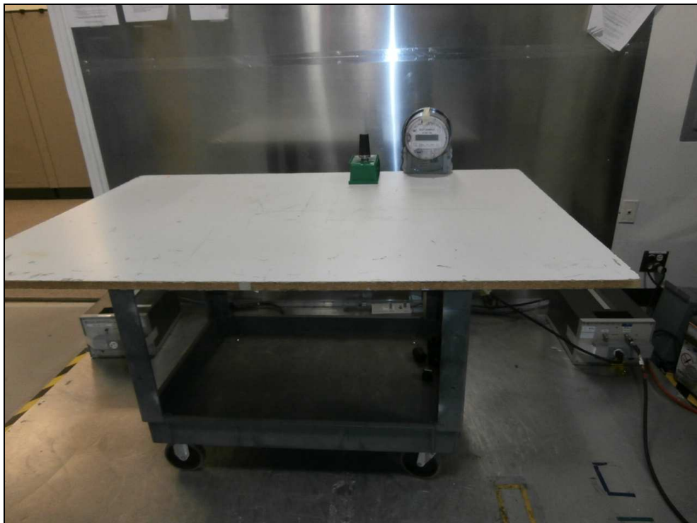
Figure 5: Conducted Emissions – 2S Meter Form – CDMA Modem External Antenna Option