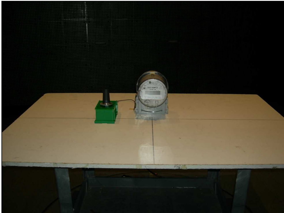
Figure 3: Radiated Emissions – 2S Meter Form – CDMA Modem External Antenna Option