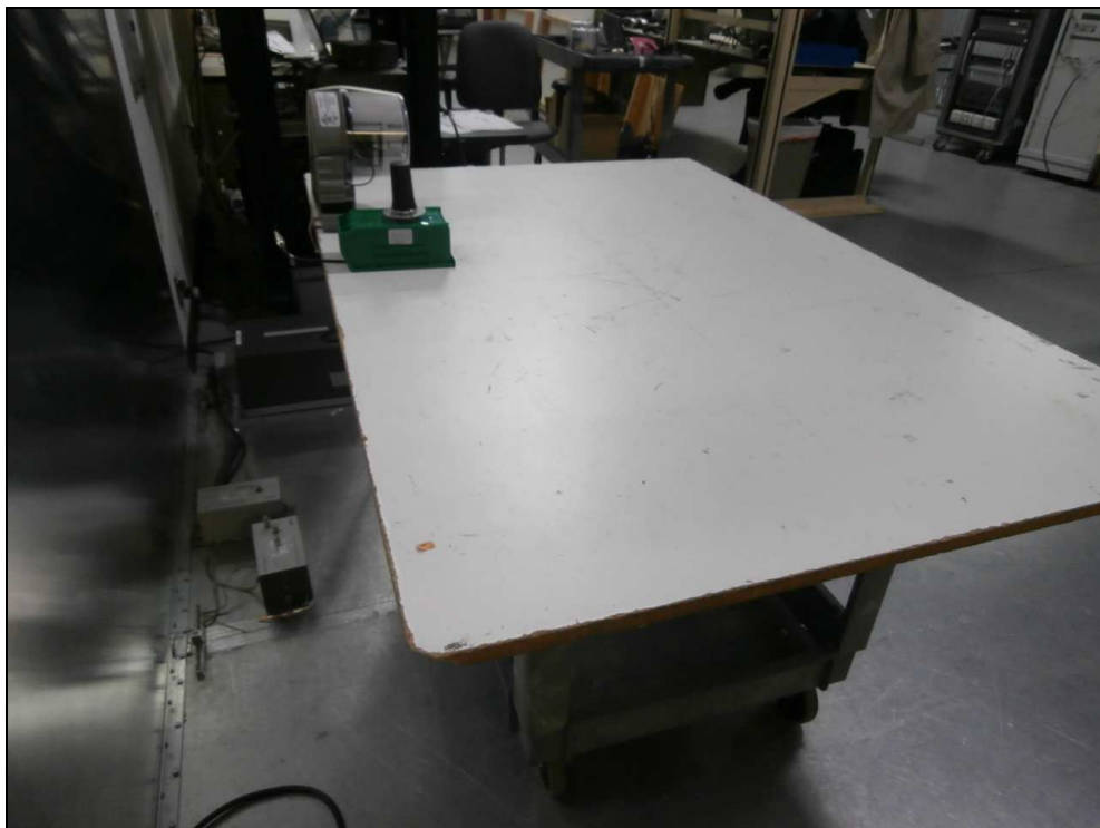
Figure 12: Conducted Emissions – 16S Meter Form – CDMA Modem External Antenna Option