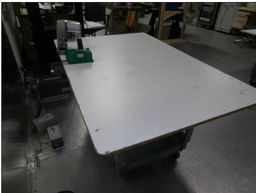
Figure 8: Conducted Emissions – 9S Meter Form – CDMA Modem External Antenna Option