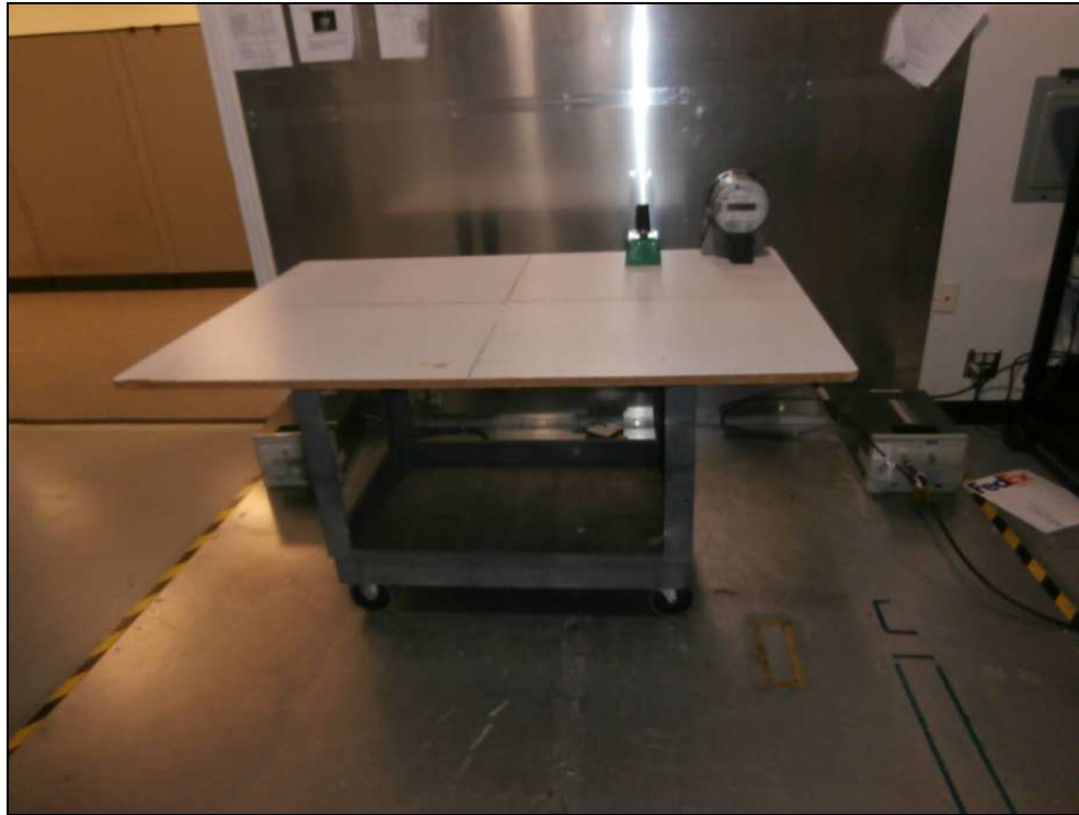
Figure 13: Conducted Emissions – 45S Meter Form – CDMA Modem External Antenna Option