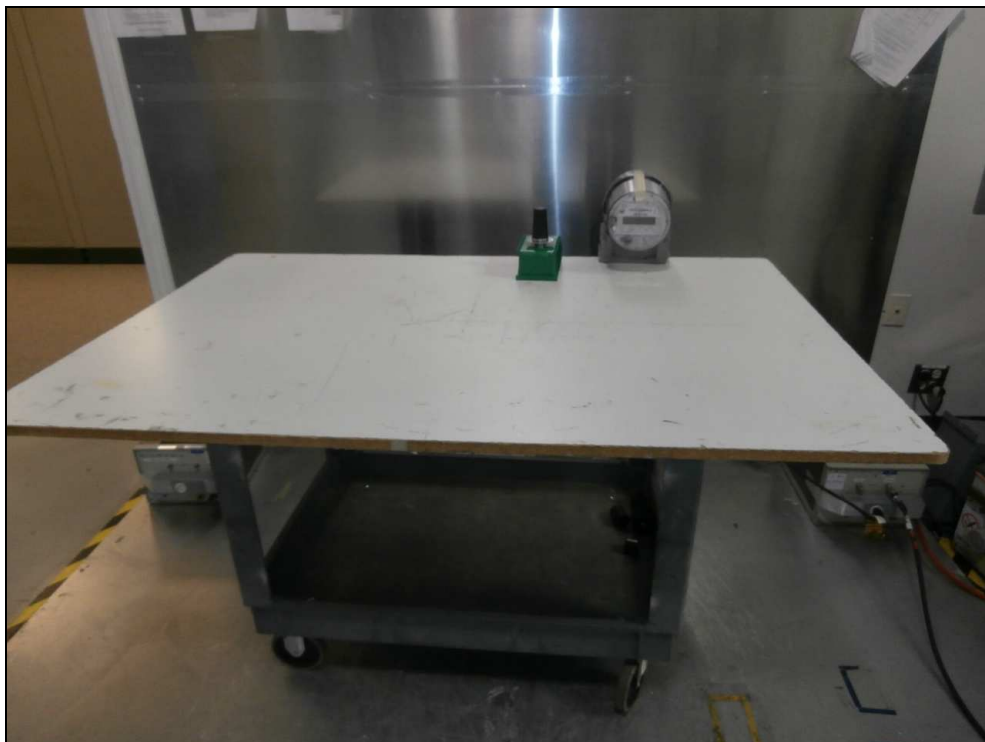
Figure 7: Conducted Emissions – 9S Meter Form – CDMA Modem External Antenna Option