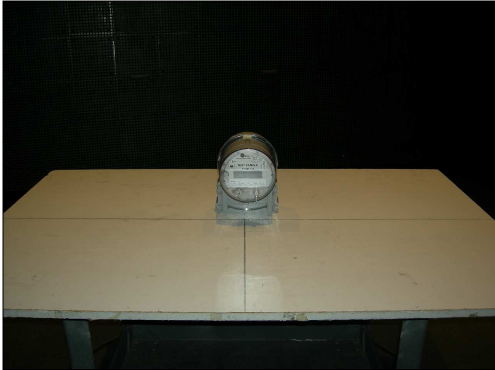
Figure 1: Radiated Emissions – 2S Meter Form