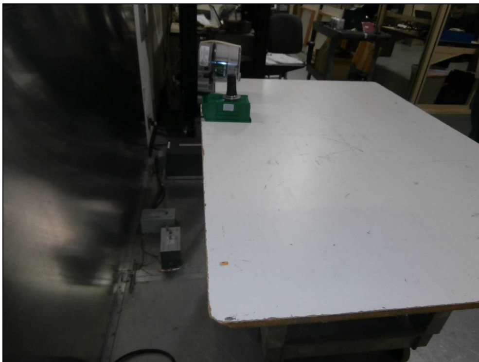
Figure 6: Conducted Emissions – 2S Meter Form – CDMA Modem External Antenna Option