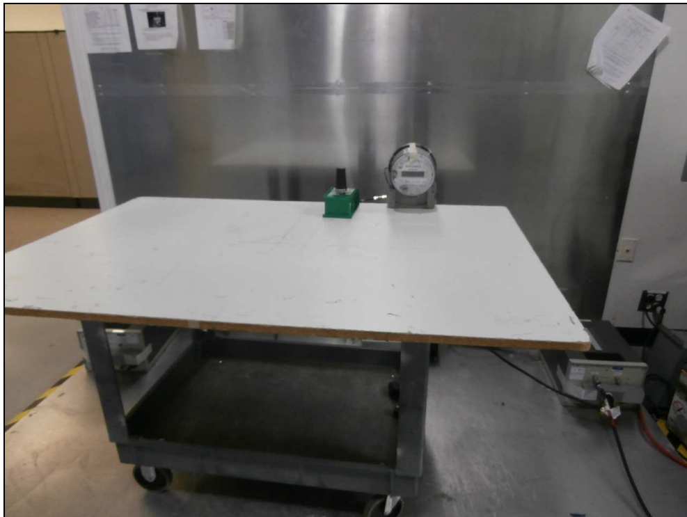
Figure 11: Conducted Emissions – 16S Meter Form – CDMA Modem External Antenna Option