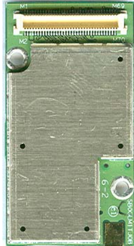
Rear View (With Shield)