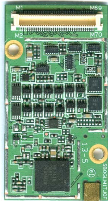
Front View (Shields Removed) Rear View (Shields Removed)