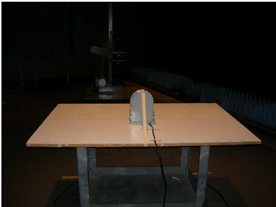
Figure 6: Radiated Emissions – 12S Meter