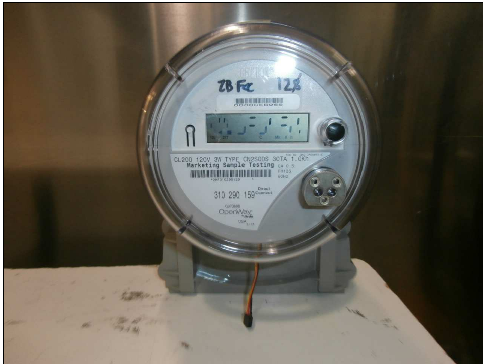
Figure 11: Conducted Emissions – 12S Meter