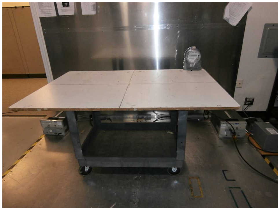
Figure 10: Conducted Emissions – 2S Meter