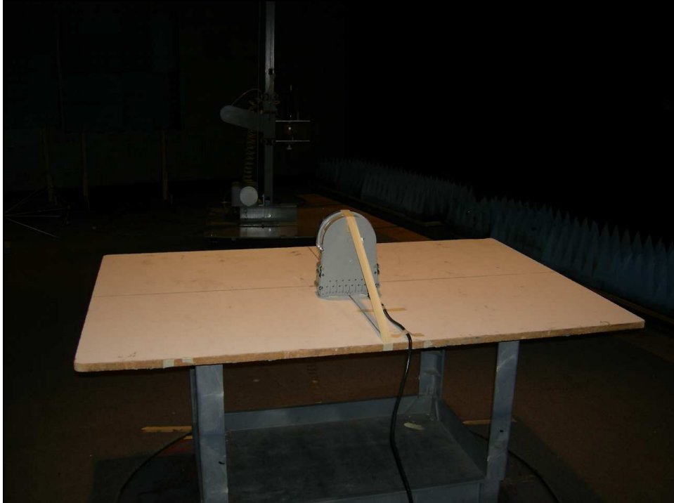
Figure 4: Radiated Emissions – 2S Meter