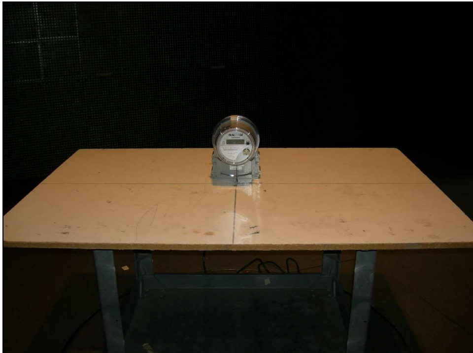
Figure 5: Radiated Emissions – 12S Meter