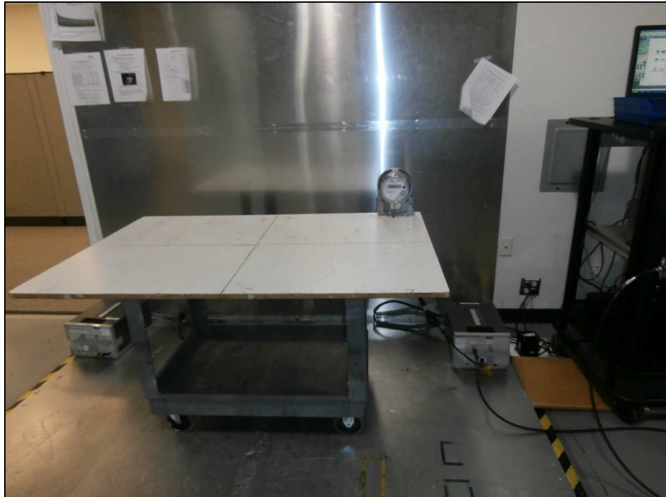
Figure 12: Conducted Emissions – 12S Meter