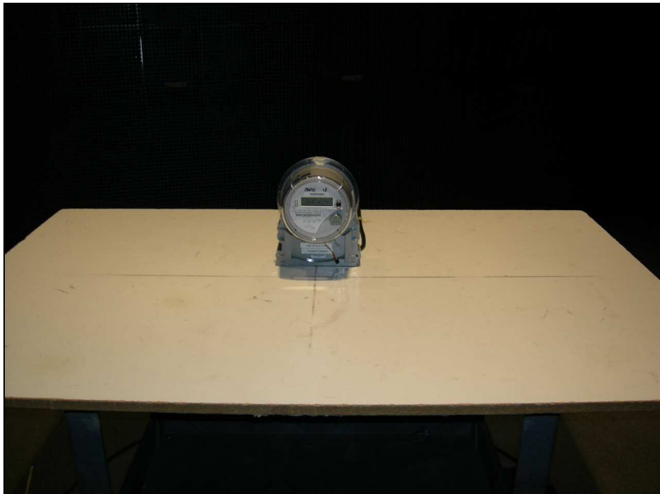
Figure 1: Radiated Emissions – 1S Meter