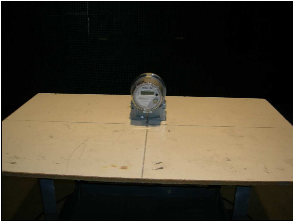
Figure 3: Radiated Emissions – 2S Meter