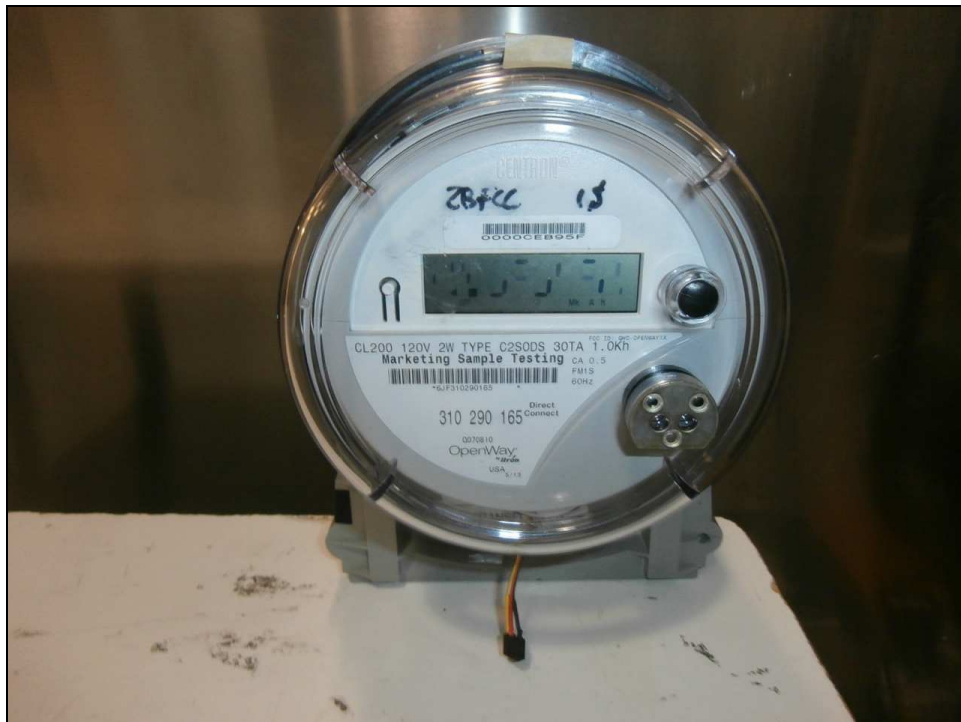
Figure 7: Conducted Emissions – 1S Meter