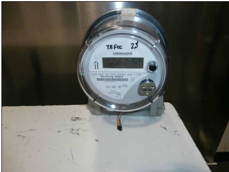
Figure 9: Conducted Emissions – 2S Meter