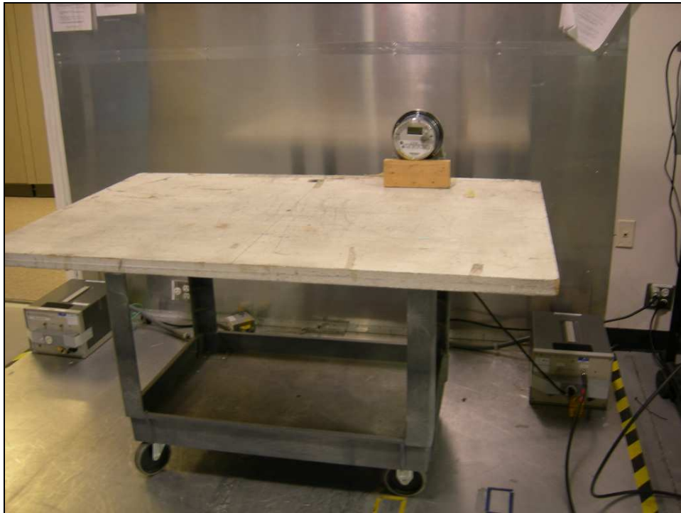
Figure 3: Test Setup Photograph – Conducted Emissions – EUT Installed in Meter