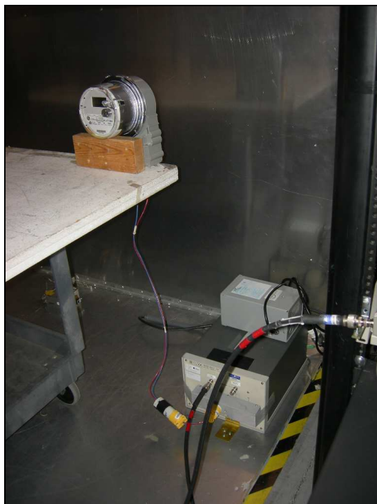
Figure 4: Test Setup Photograph – Conducted Emissions – EUT Installed in Meter