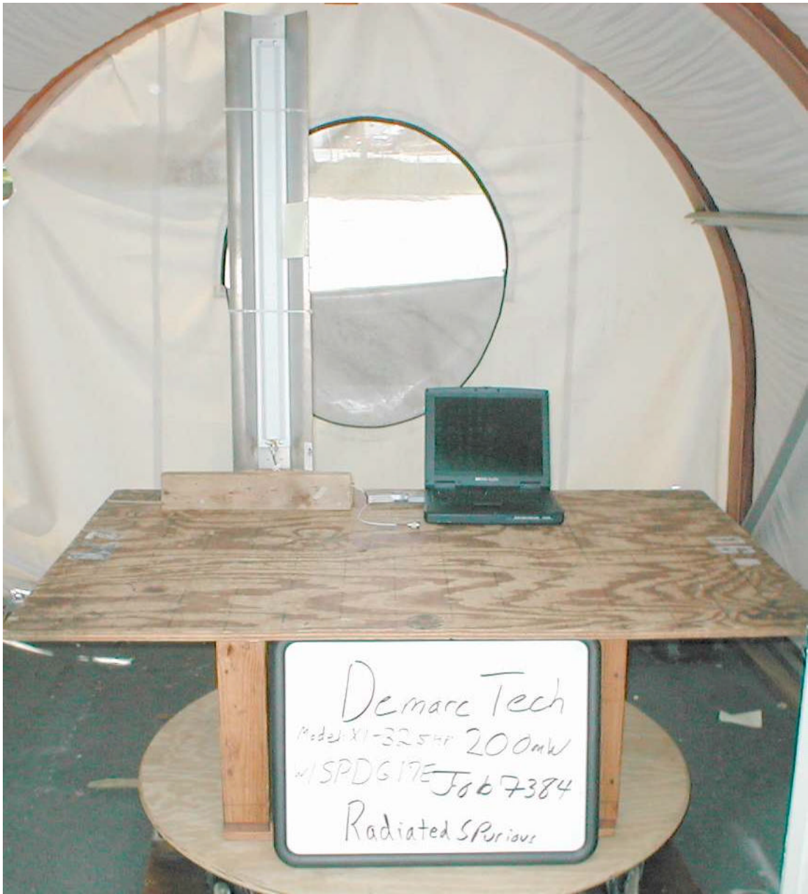
SPDG17E Antenna, Front