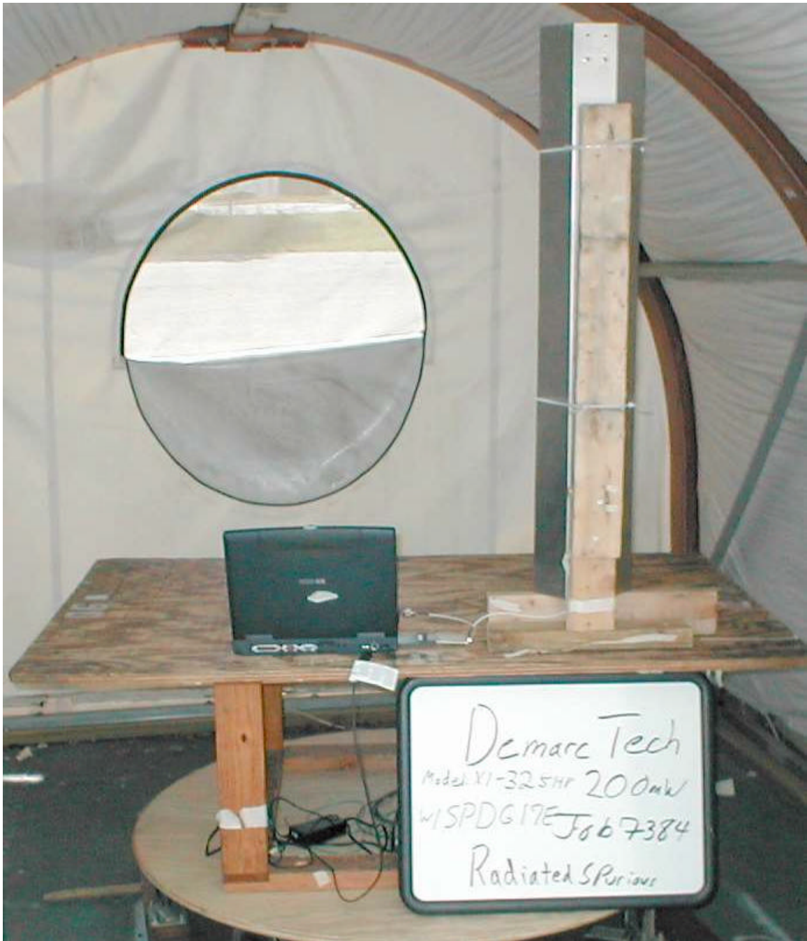
SPDG17E Antenna, Back