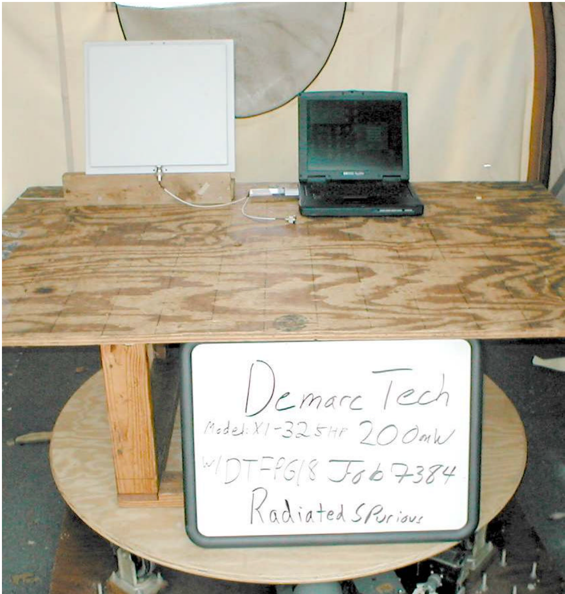
DTFPG18 Antenna, Front