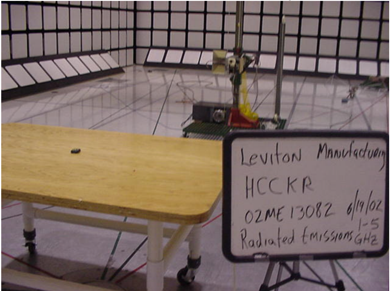
Radiated Emissions 1-5 GHz