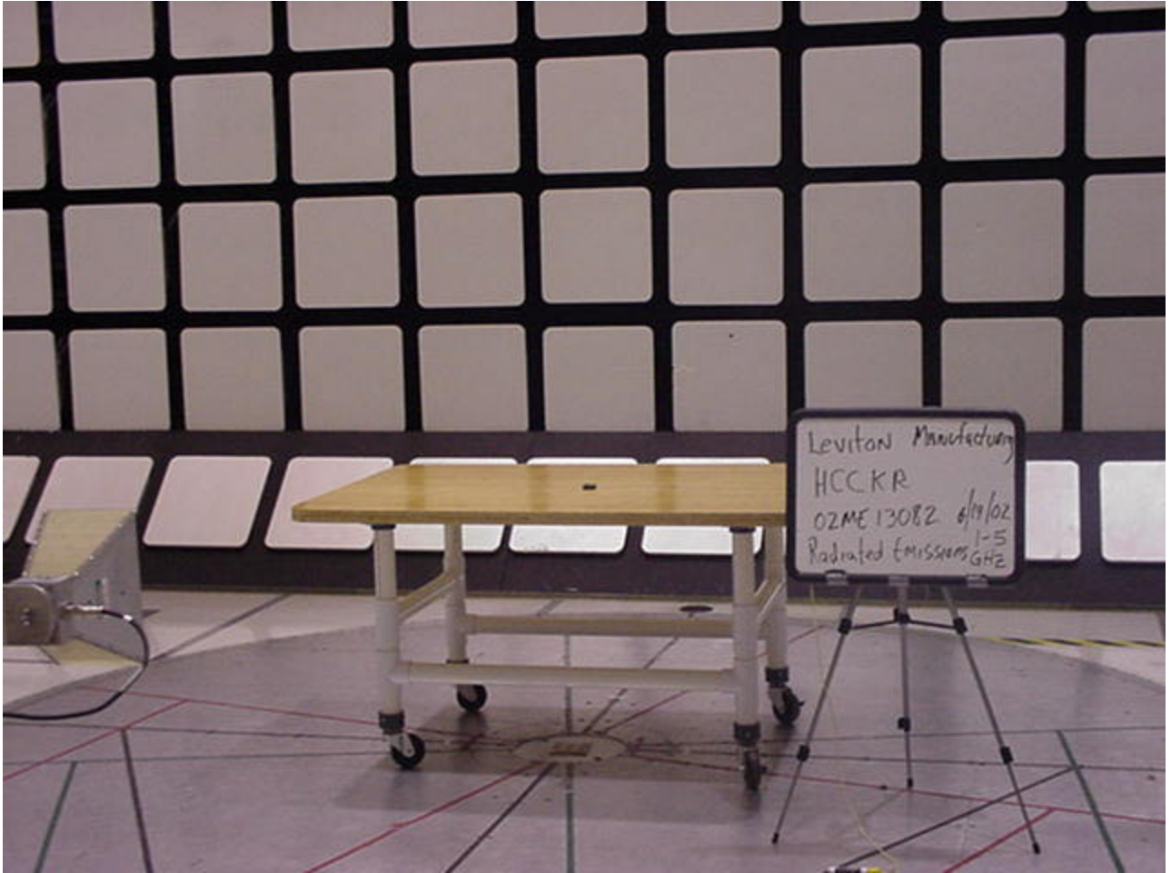
Radiated Emissions 1.0-5.0 GHz