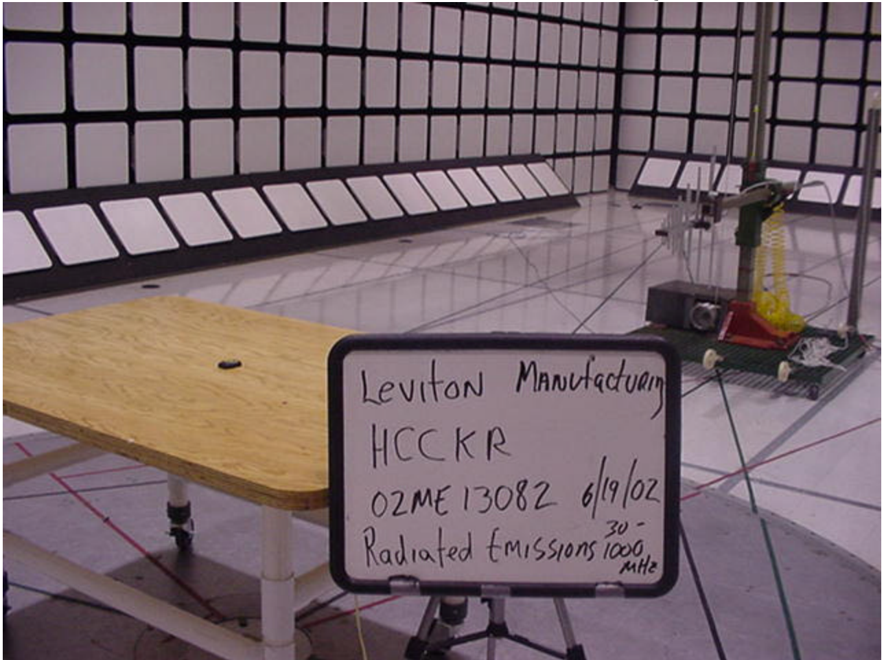
Radiated Emissions 30-1000 MHz