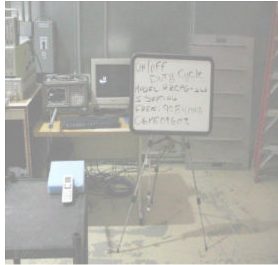
On/Off test set up