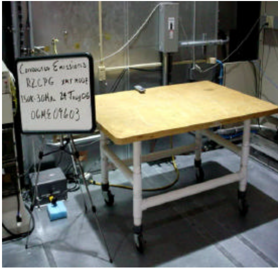
Conducted Emissions test set up