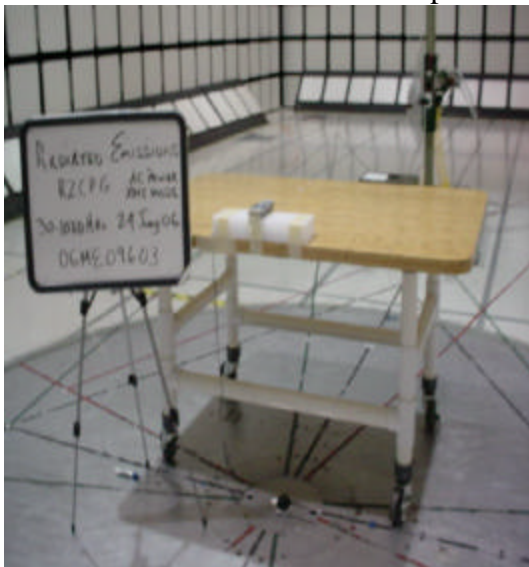
Radiated Emissions 30-1000MHz