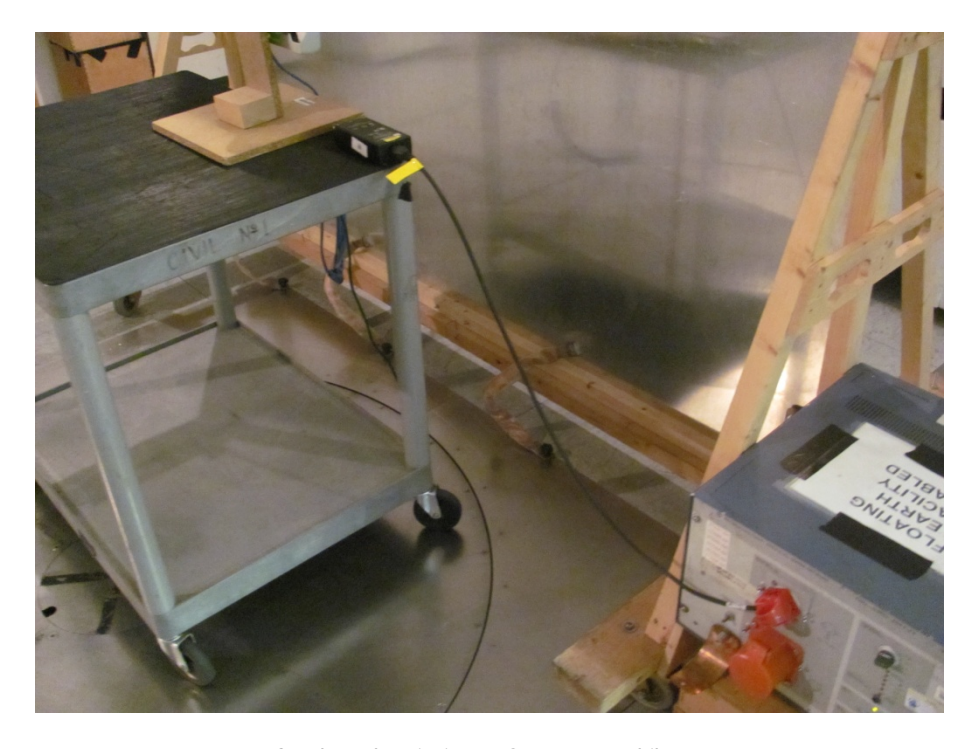
Conducted Emissions POE Inserter Phihong