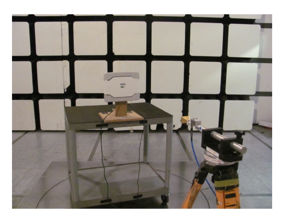
Radiated Emissions 18-20GHz