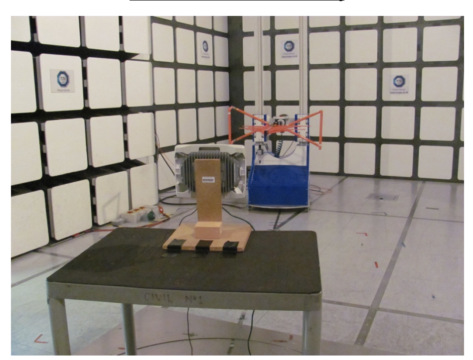
Radiated Emissions 30MHz-1GHz