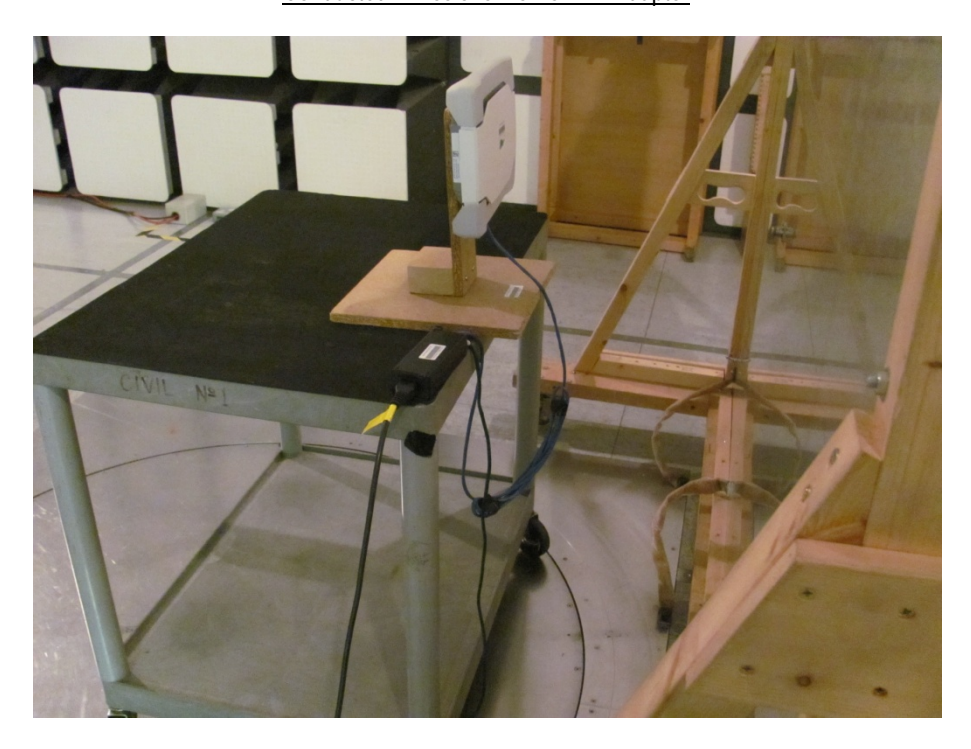
Conducted Emissions POE Inserter Microsemi