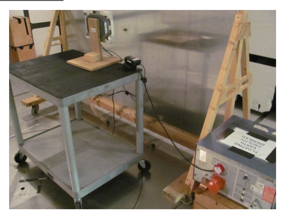
Conducted Emissions ACDC 12V Adaptor