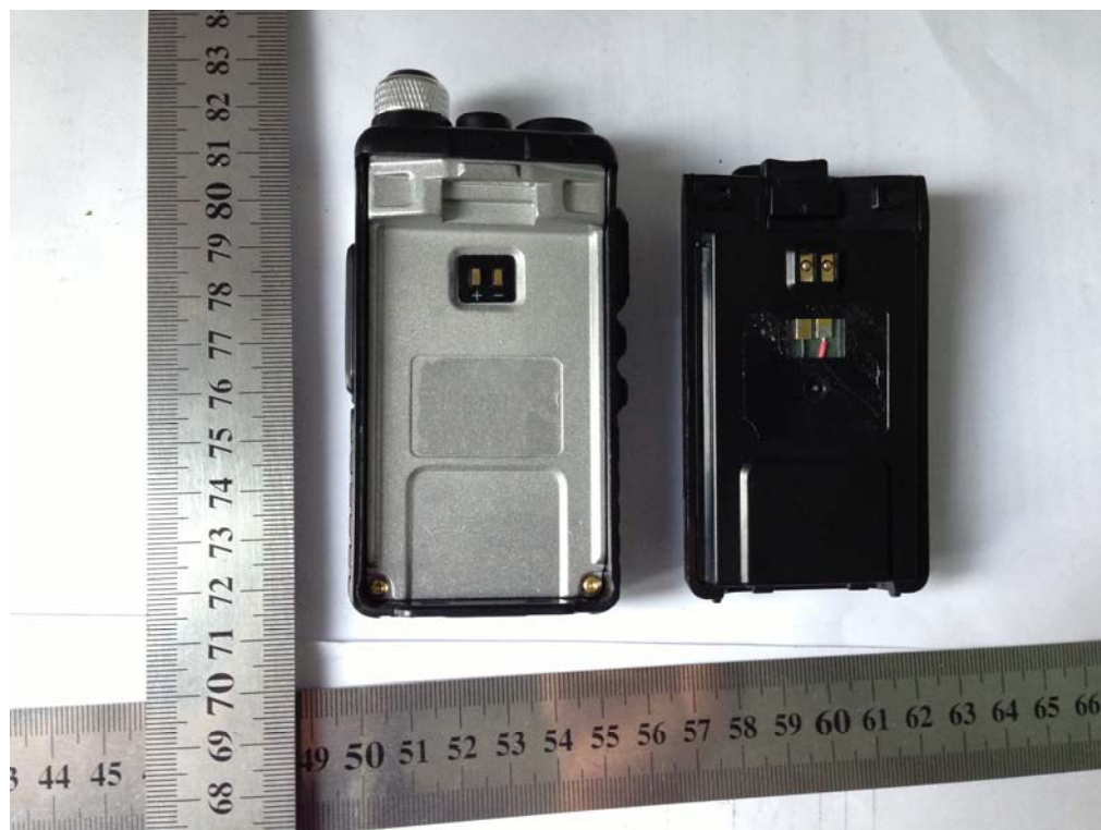
INTERNAL PHOTO OF SAMPLE-1