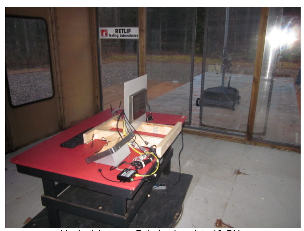
Vertical Antenna Polarization, 1 to 18 GHz