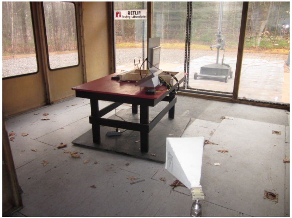
Horizontal Antenna Polarization, 18 to 25 GHz