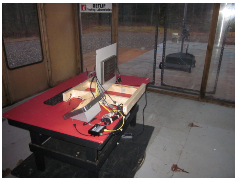
Horizontal Antenna Polarization, 1 to 18 GHz