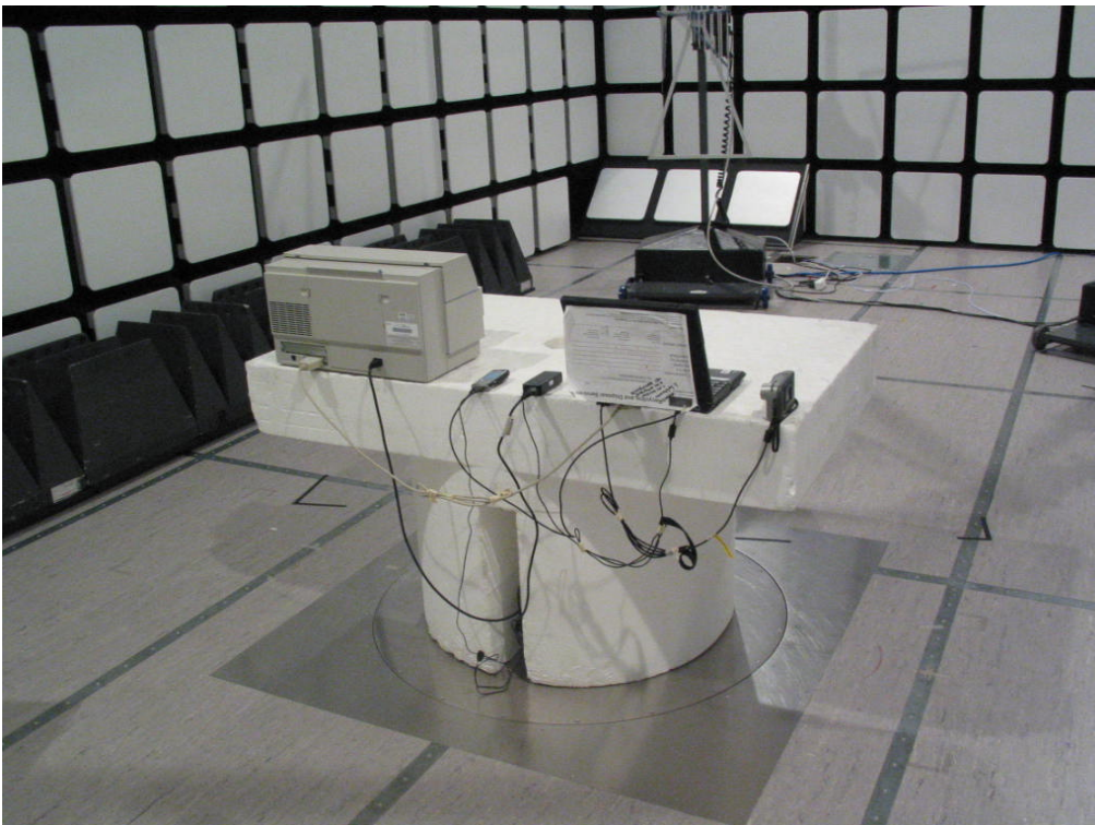
Picture 2 Radiated emission measurement