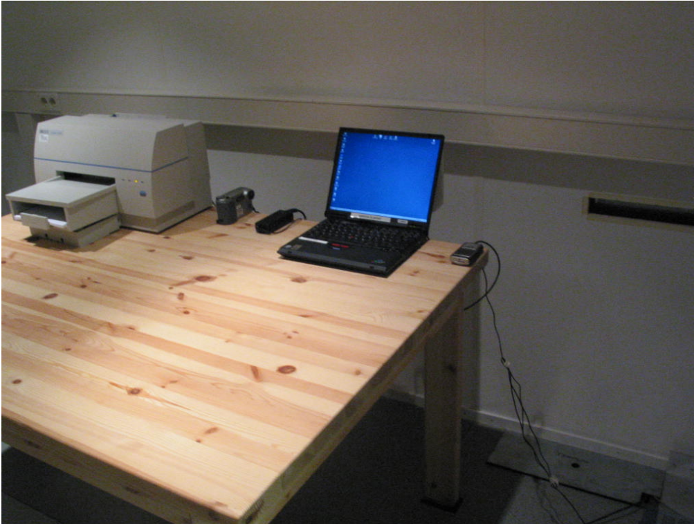
Picture 3 AC powerline conducted emission measurement