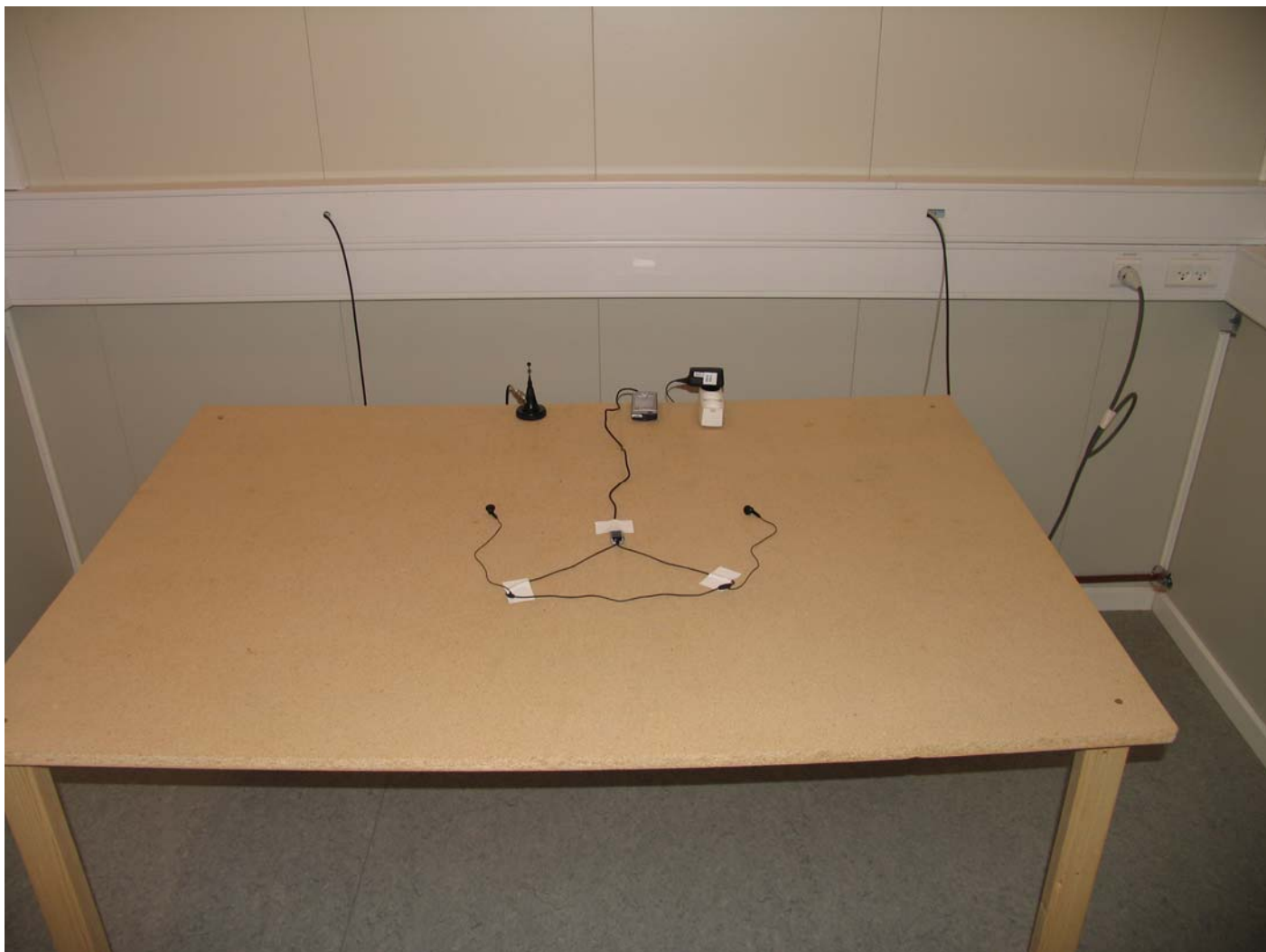
Part 15C Conducted emission BT & WLAN