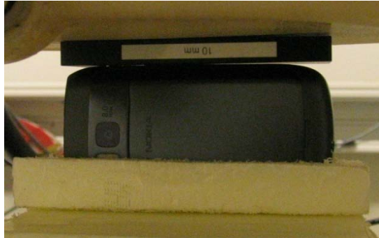
Photo of the device positioned for WR mode measurement – left edge facing phantom. The spacer was removed before the start of the measurements.