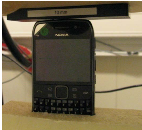
Photo of the device positioned for WR mode measurement – top edge facing phantom. The spacer was removed before the start of the measurements.