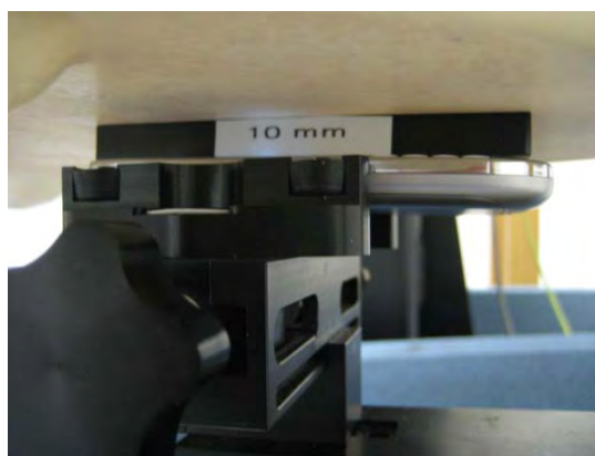
Photo of the device positioned for WR mode measurement – display facing phantom. The spacer was removed before the start of the measurements.

The device was placed in the SPEAG holder using the Nokia spacer and, in sequence, the display side, the back and each of the 4 edges was positioned 10mm away from the flat phantom. The spacer was removed before the start of the measurements.