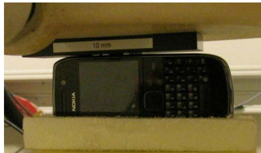
Photo of the device positioned for WR mode measurement – right edge facing phantom. The spacer was removed before the start of the measurements.