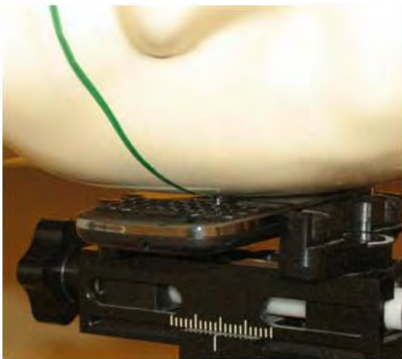
Photo of the Device in "cheek" position

The positions used in the measurements were according to IEEE 1528 - 2003 "IEEE Recommended Practice for Determining the Peak Spatial-Average Specific Absorption Rate (SAR) in the Human Head from Wireless Communications Devices: Measurement Techniques".