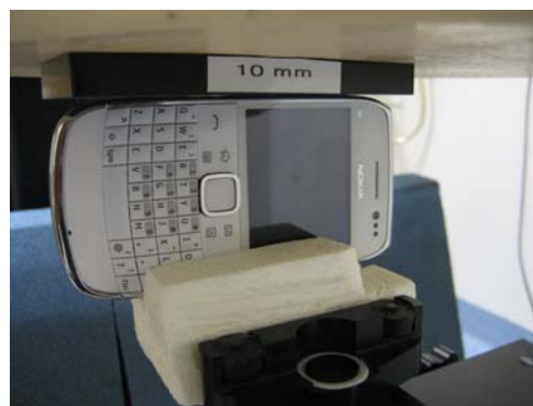
Photo of the device positioned for WR mode measurement – left edge facing phantom. The spacer was removed before the start of the measurements.