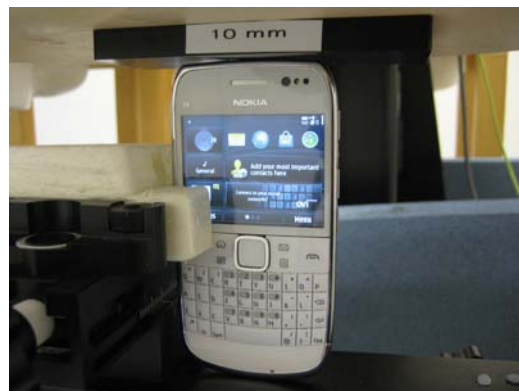
Photo of the device positioned for WR mode measurement – top edge facing phantom. The spacer was removed before the start of the measurements.