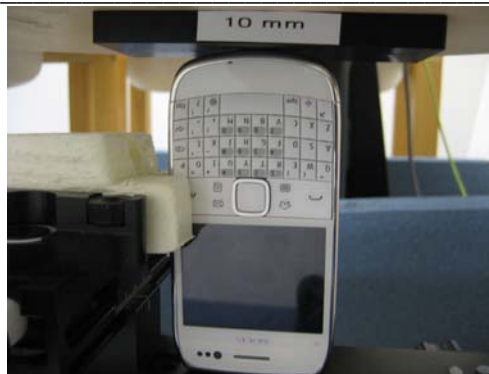
Photo of the device positioned for WR mode measurement – bottom edge facing phantom. The spacer was removed before the start of the measurements.