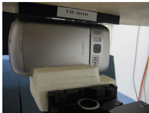
Photo of the device positioned for WR mode measurement – right edge facing phantom. The spacer was removed before the start of the measurements.