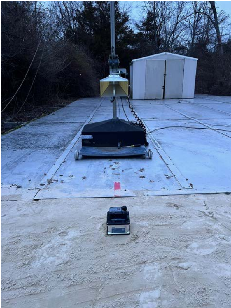
Above 1GHz ( 1m measurement for low emission signals)