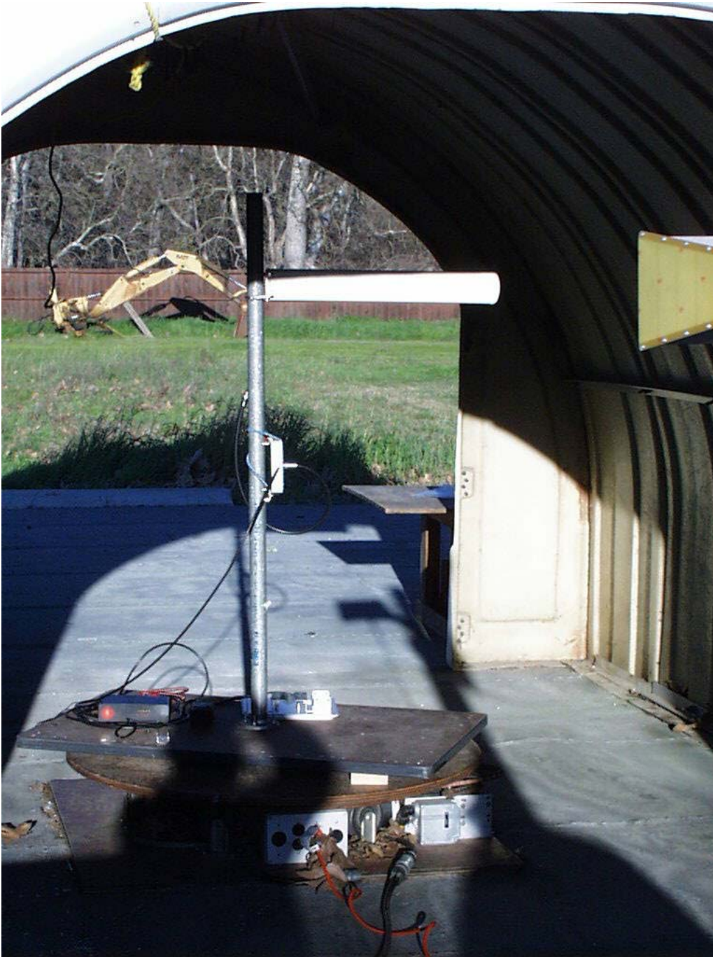
15 dBi antenna, radiated test set-up

Pointred Technologies FCC ID: QDU-MCRD-2R4