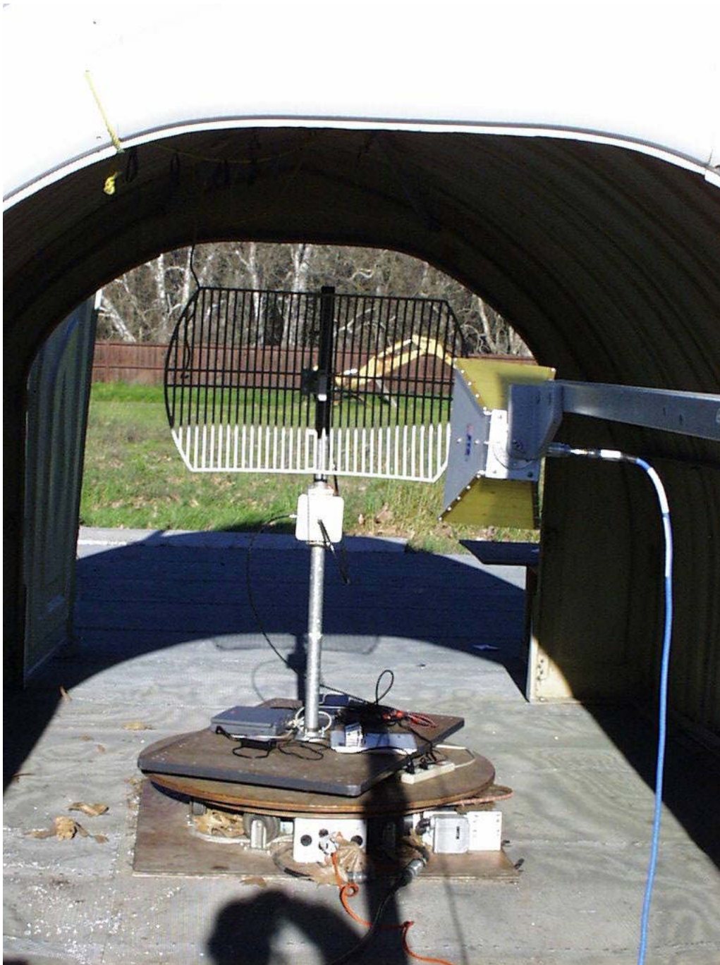
24 dBi dish antenna, radiated emissions test set-up