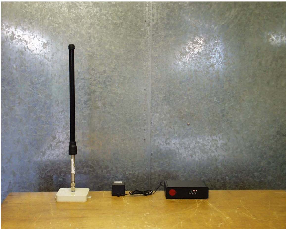
Line conducted test setup, front view