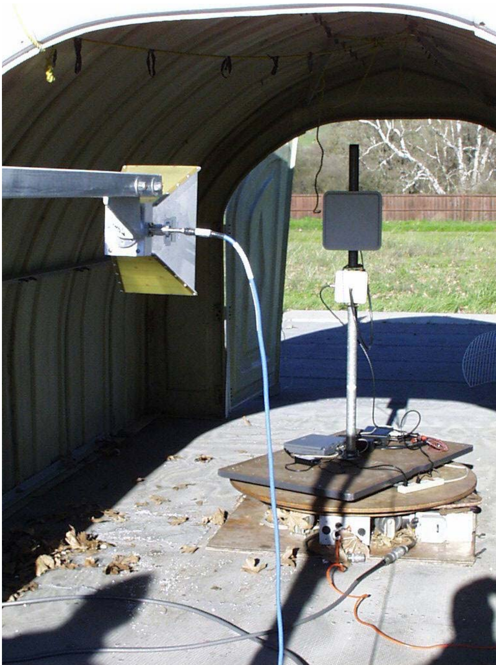
Flat panel antenna radiated test set-up