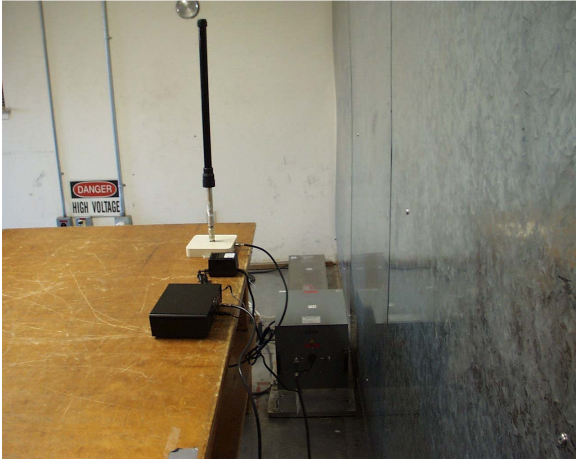
Line conducted test, rear view