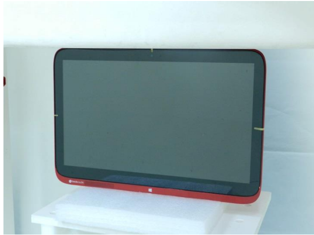
Edge1, Test Separation 0 cm