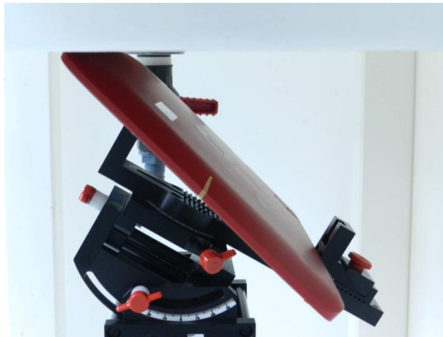
Curved surface of Edge1, Test Separation 0 cm