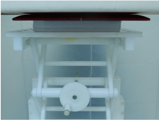
Bottom Face, Test Separation 0 cm