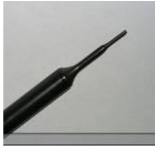
Interior of probe

Application: High precision dosimetric measurements in any exposure scenario (e.g., very strong gradient fields). Only probe which enables compliance testing for frequencies up to 6 GHz with precision of better 30%.