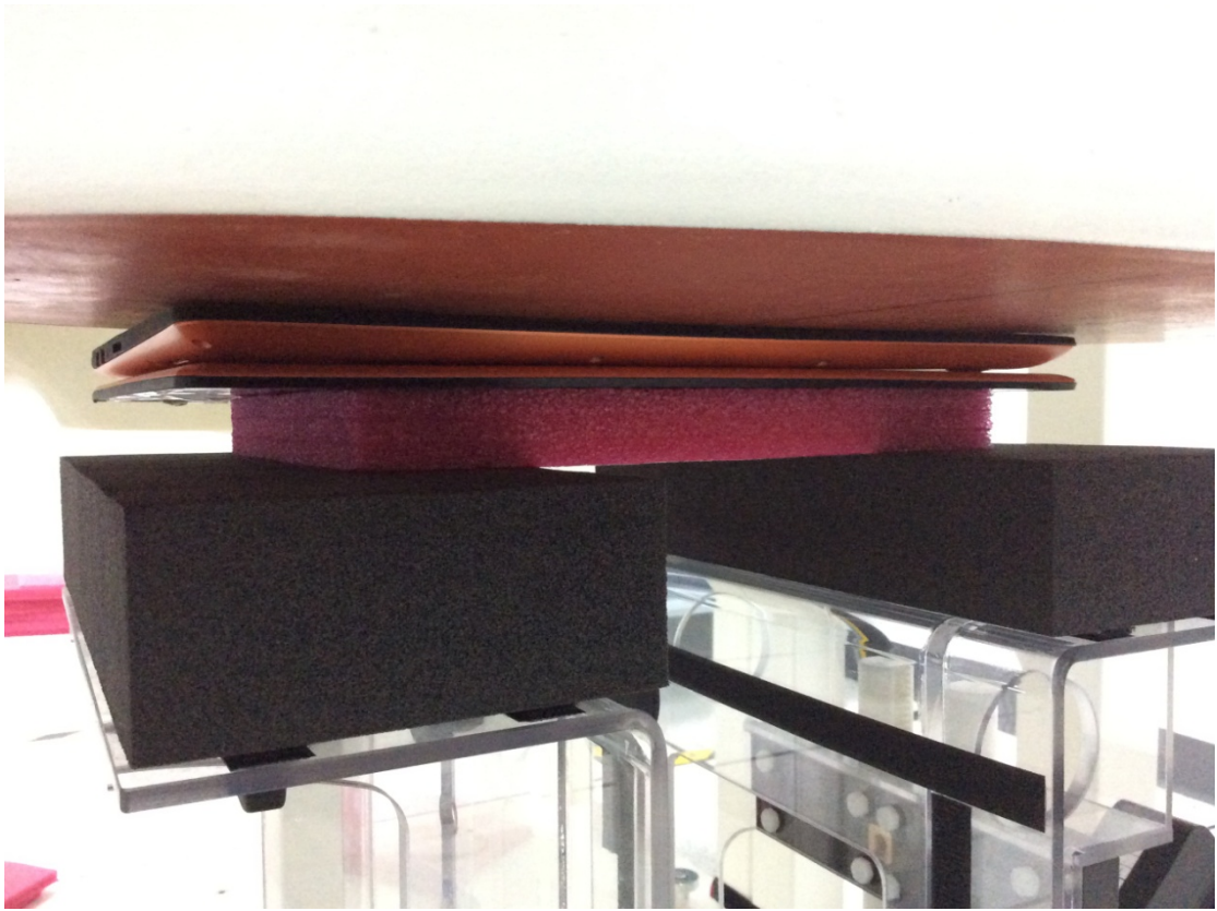
Bystander with gap 25mm for 5GHz