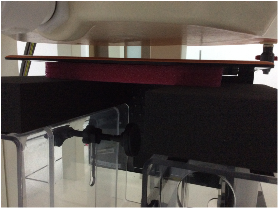
Edge1 with gap 0mm for 5GHz