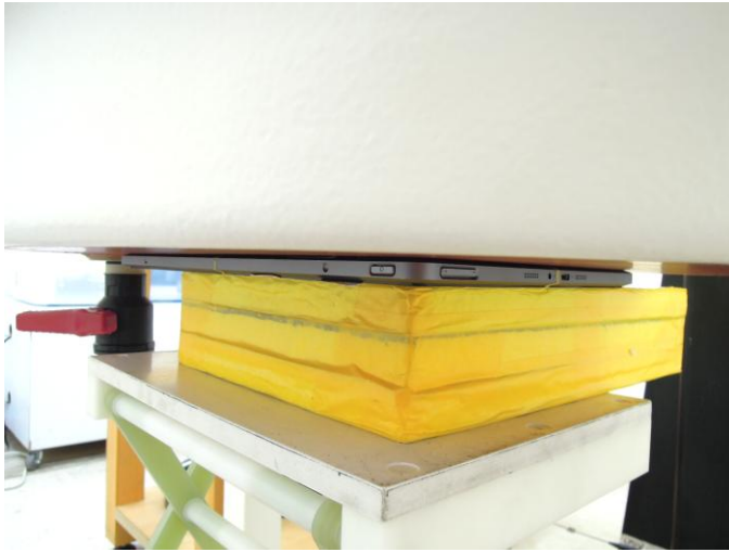
Rear Face of EUT with 0 cm Gap