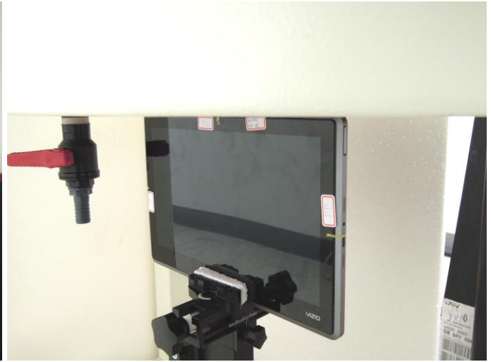
Secondary Landscape with 0 cm Gap