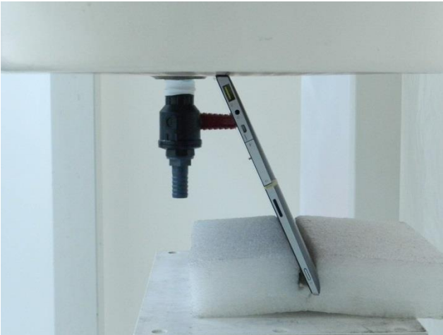
Slant of Edge 3, Test Separation 0 cm