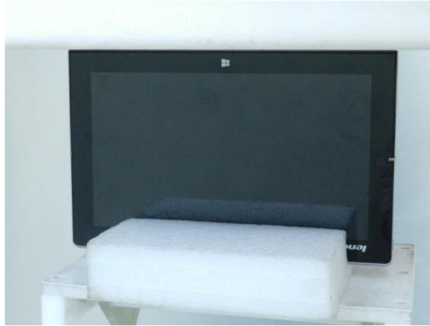
Edge3, Test Separation 0 cm