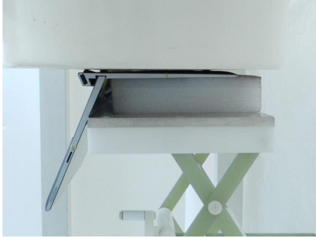
Bottom of Laptop, Test Separation 0 cm