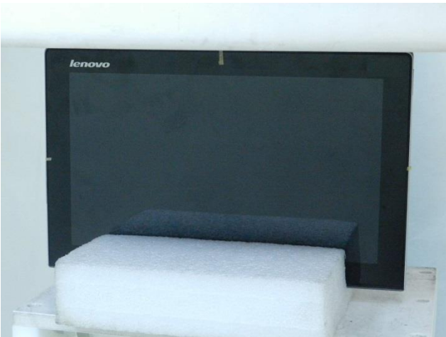
Edge1, Test Separation 0 cm