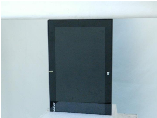
Edge2, Test Separation 0 cm