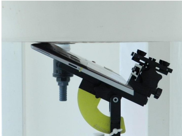
Curved surface of Edge1, Test Separation 0 cm