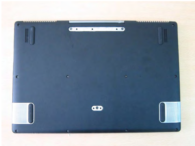
Fig.2 Back view of EUT

Unless otherwise stated the results shown in this test report refer only to the sample(s) tested and such sample(s) are retained for 90 days only.