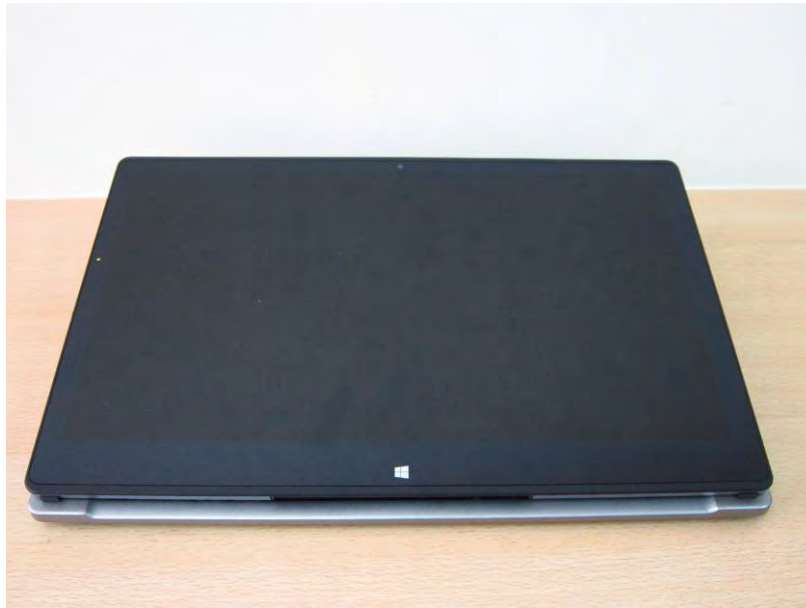
Fig.3 Tablet mode of EUT