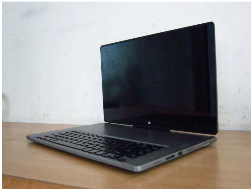
Fig.4 Laptop mode of EUT

Unless otherwise stated the results shown in this test report refer only to the sample(s) tested and such sample(s) are retained for 90 days only.