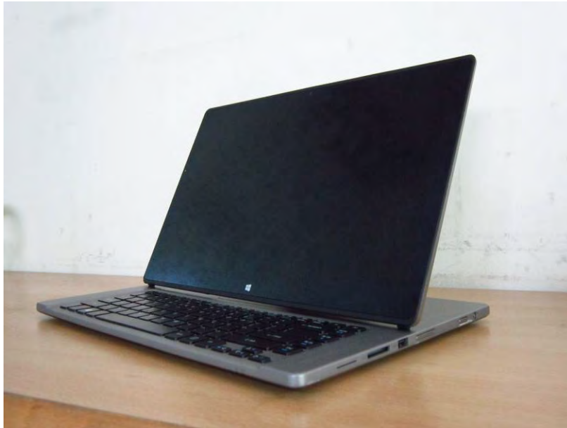
Fig.5 Floating mode of EUT

Unless otherwise stated the results shown in this test report refer only to the sample(s) tested and such sample(s) are retained for 90 days only. 除非另有說明，此報告結果僅對測試之樣品負責，同時此樣品僅保留90天。本報告未經本公司書面許可，不可部份複製。