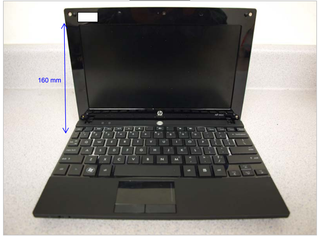
END OF REPORT