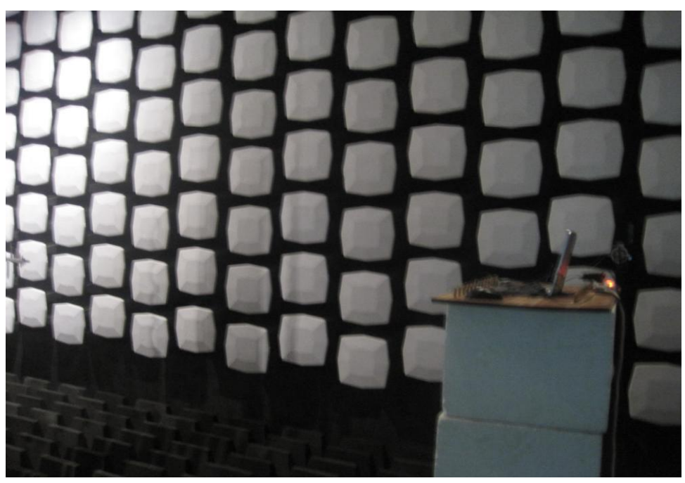
Radiated Disturbance Emissions (above 3GHz)