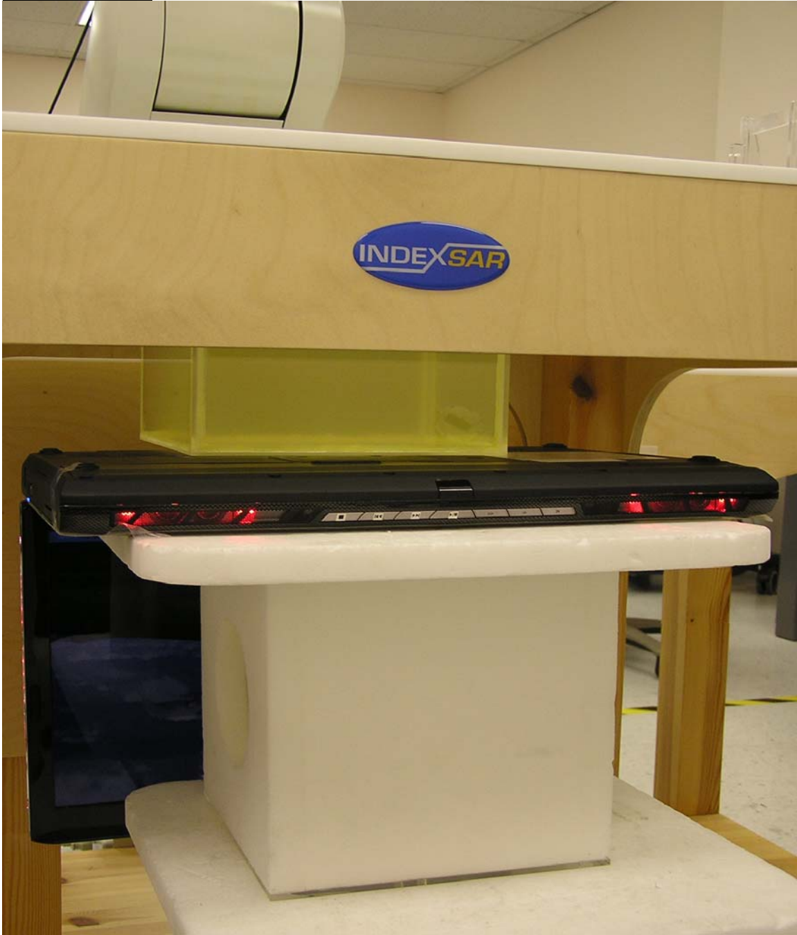
Photo 1. Auxiliary antenna, lap position