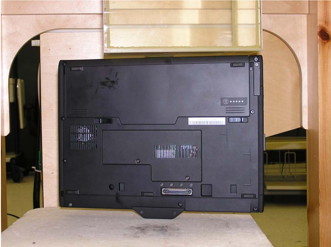
Photo 1. Main and Auxiliary antennas, Top position