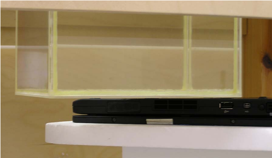
Photo 3. Main and Auxiliary antennas, Lap position