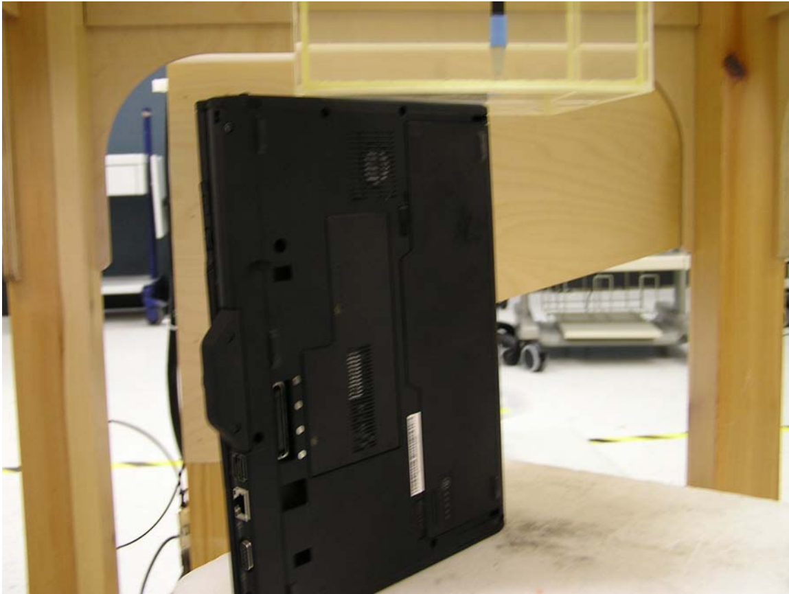
Photo 2. Main and Auxiliary antennas, Side position