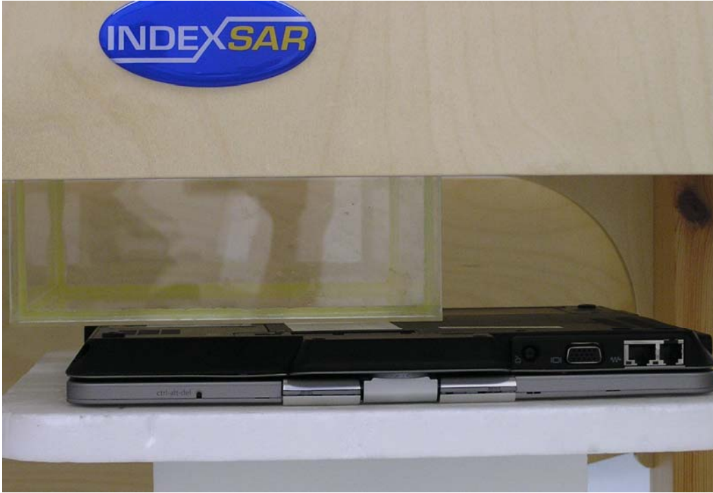
Photo 1. Lap A Position