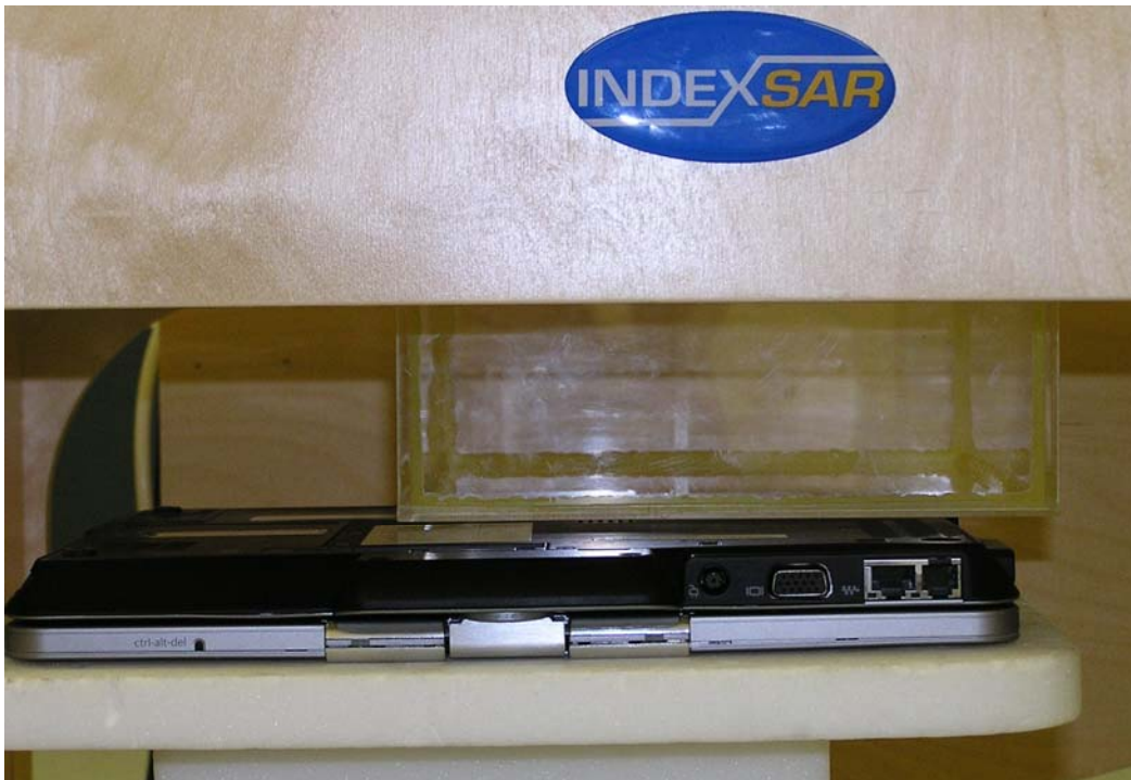
Photo 2. Lap B Position