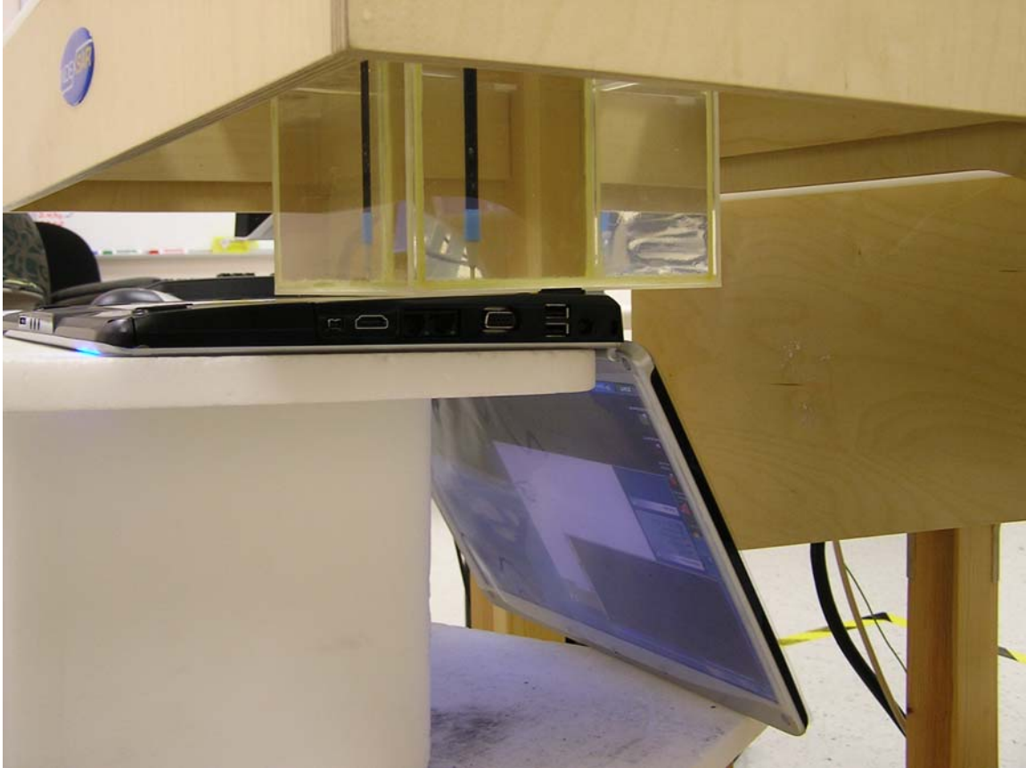
Photo 1. Auxiliary antenna, lap position