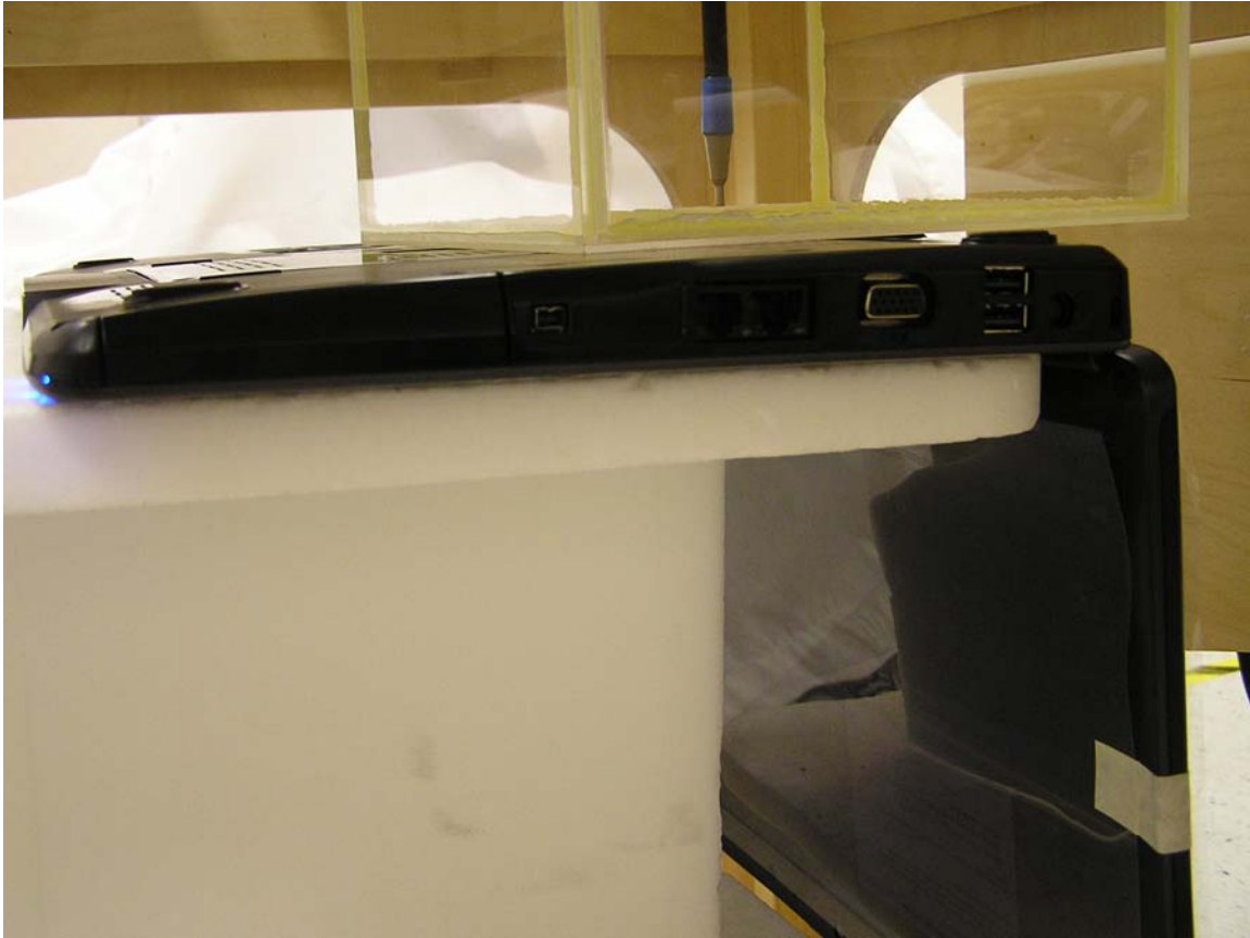
Photo 1. Auxiliary antenna, lap position