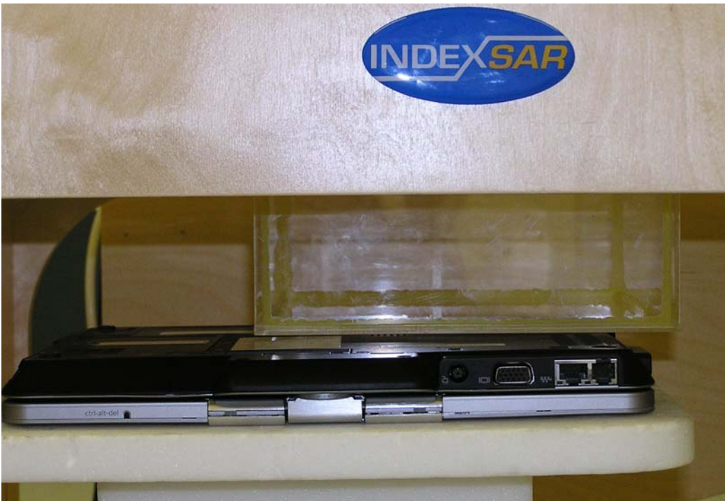
Photo 2. Lap B Position