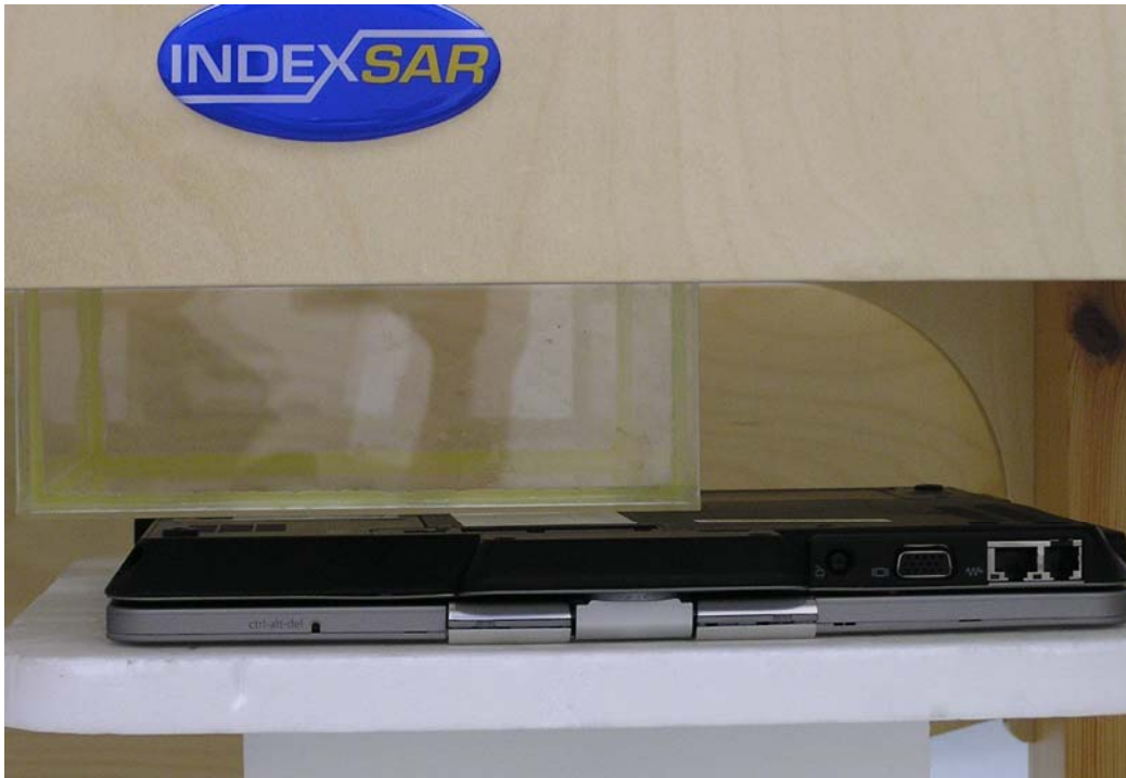
Photo 1. Lap A Position