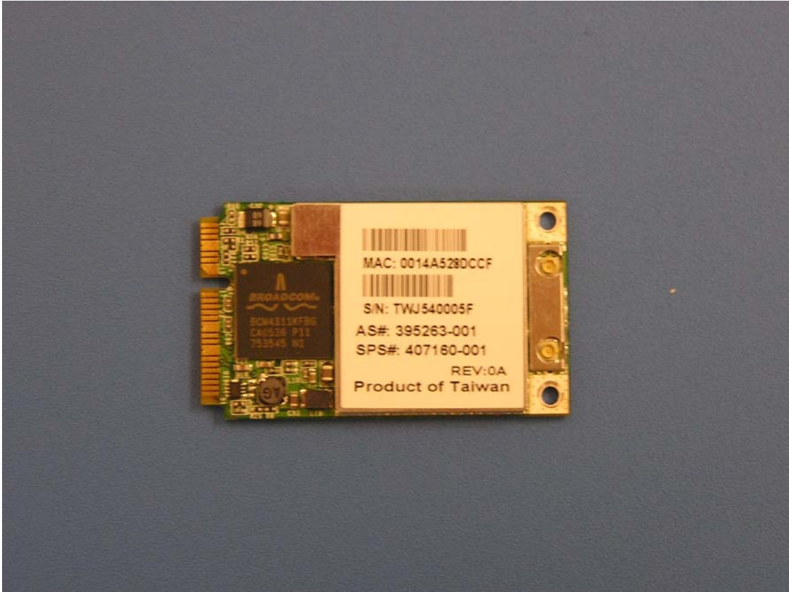
Photo 2. Card top