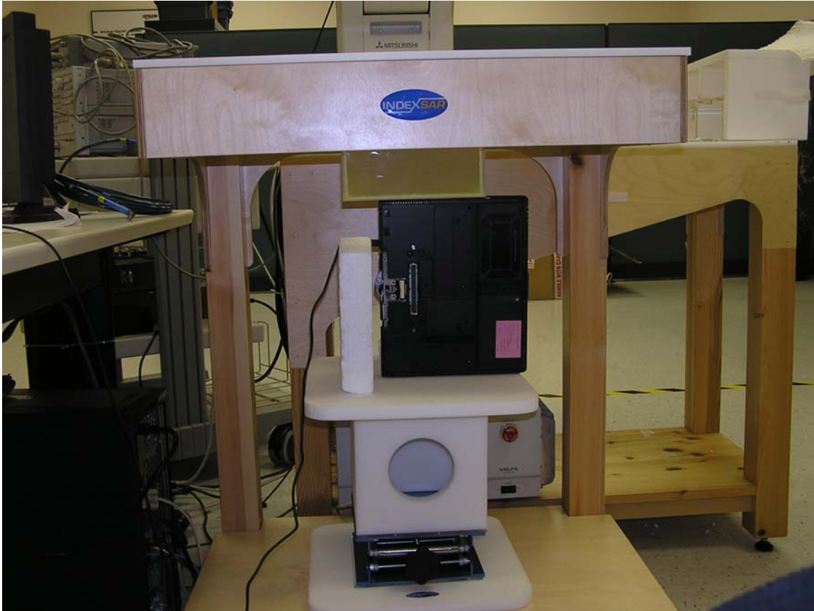
Photo 6. Tablet position, auxiliary antenna side contact