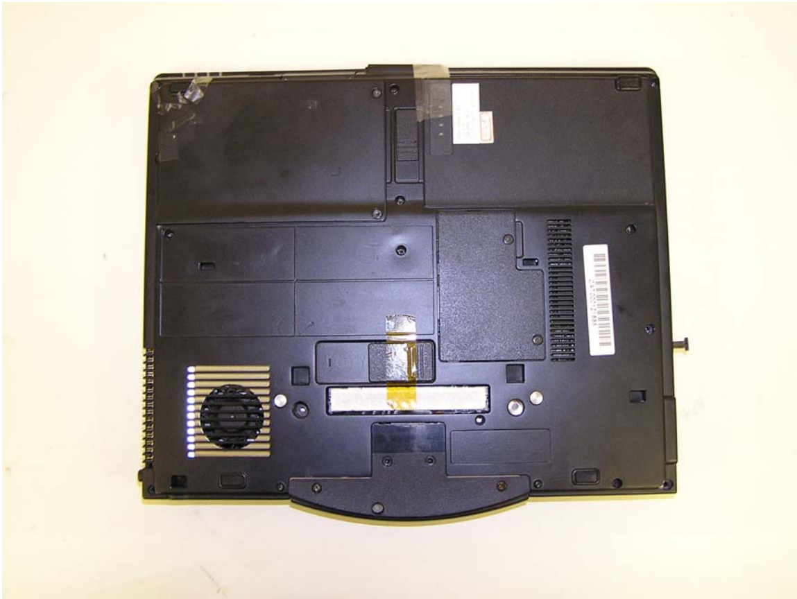
Photo 4. PC bottom tablet position