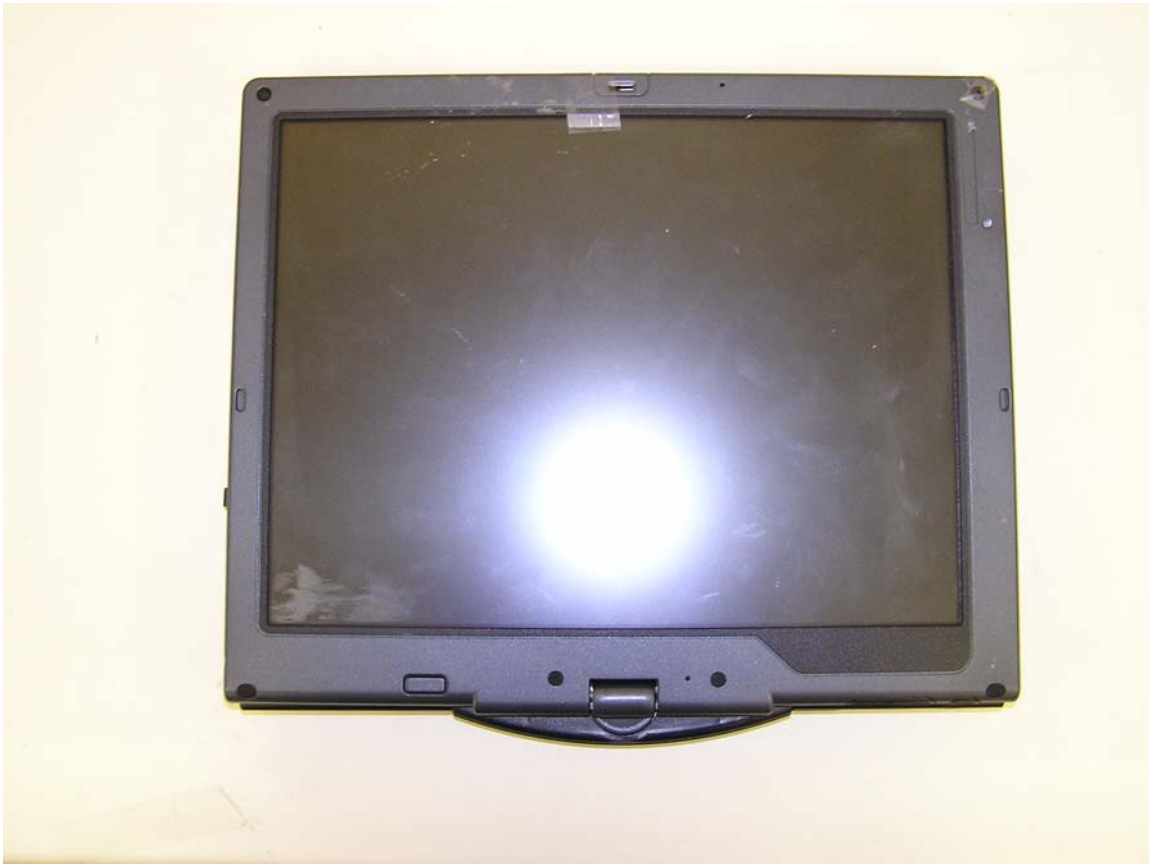
Photo 5. PC top tablet position