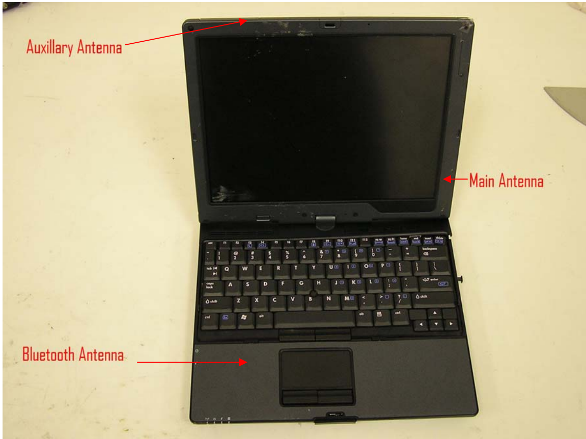
Photo 1. Antenna locations