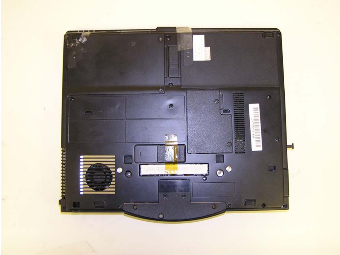
Photo 4. PC bottom tablet position