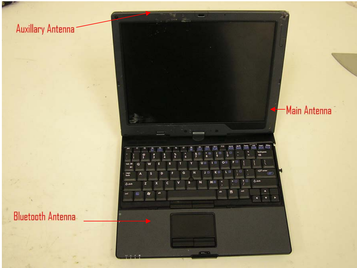
Photo 1. Antenna locations