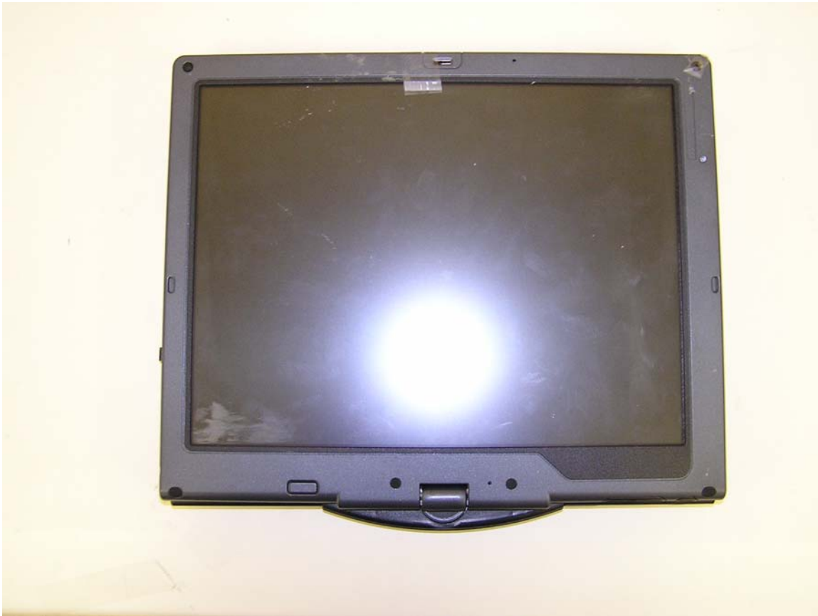
Photo 5. PC top tablet position