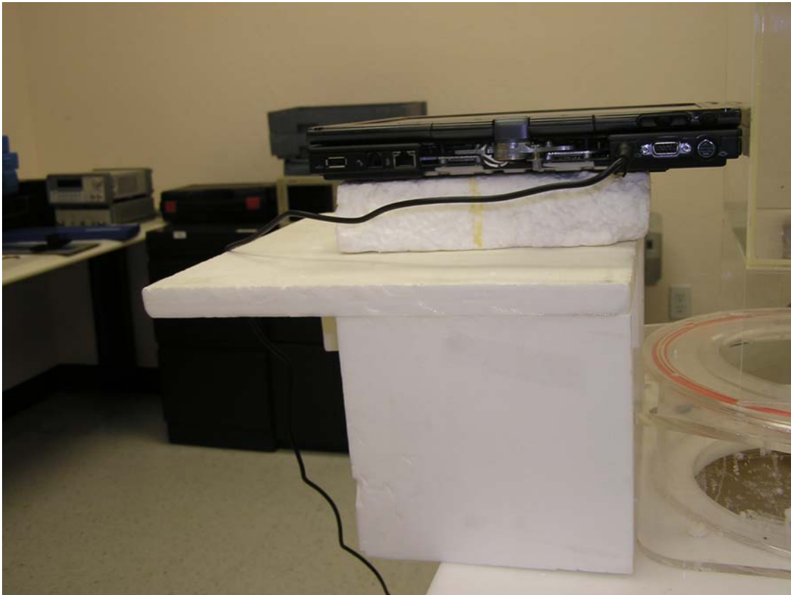
Photo 6. Tablet position, auxiliary antenna, side contact