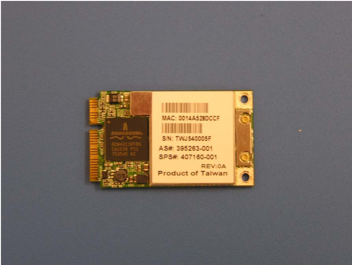
Photo 2. Card top