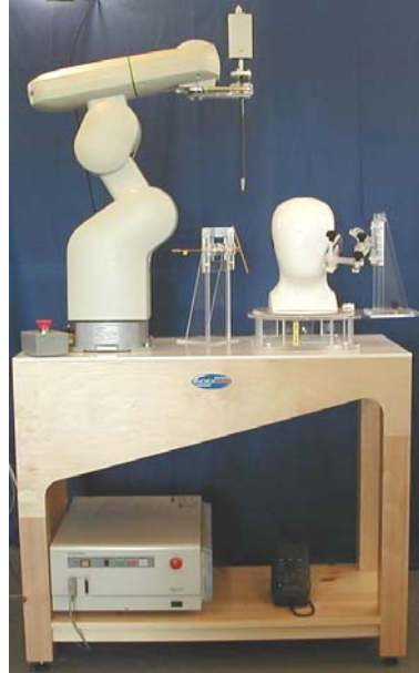
Figure 6: Principal components of the SAR measurement test bench

The major components of the test bench are shown in the picture above. A test set and dipole antenna control the handset via an air link and a low-mass phone holder can position the phone at either ear. Graduated scales are provided to set the phone in the 15 degree position. The upright phantom head holds approx. 7 litres of simulant liquid. The phantom is filled and emptied through a 45mm diameter penetration hole in the top of the head.