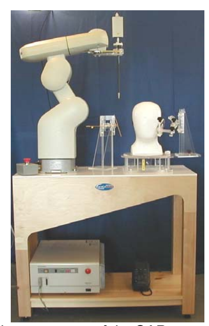
Figure 6: Principal components of the SAR measurement test bench

The major components of the test bench are shown in the picture above. A test set and dipole antenna control the handset via an air link and a low-mass phone holder can position the phone at either ear. Graduated scales are provided to set the phone in the 15 degree position. The upright phantom head holds approx. 7 litres of simulant liquid. The phantom is filled and emptied through a 45mm diameter penetration hole in the top of the head.