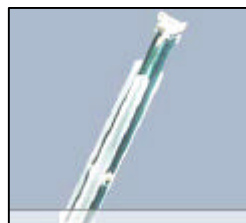
Interior of probe