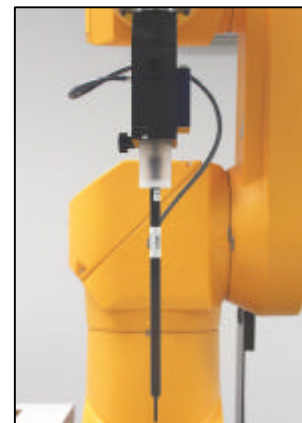
Isotropic E-Field Probe