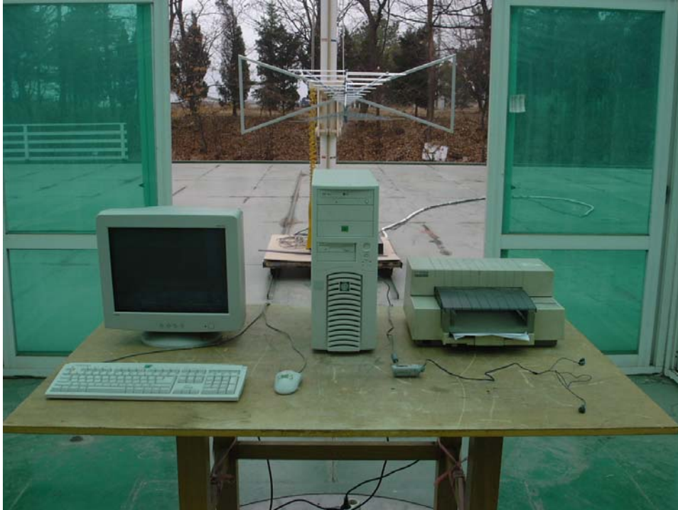
Radiated Emission ( Rear )