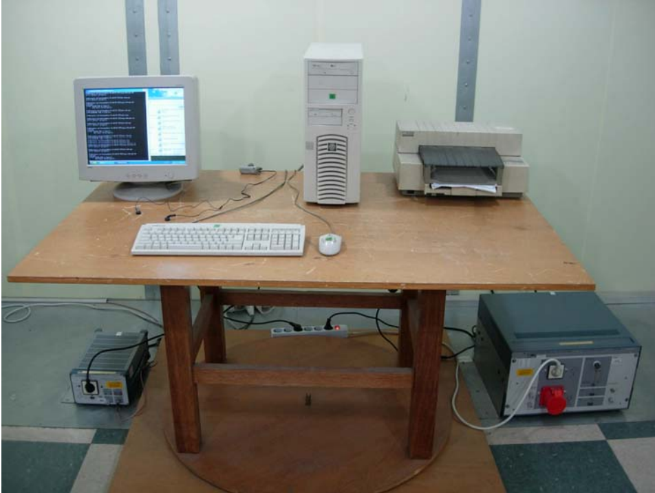
Conducted emission ( Rear )