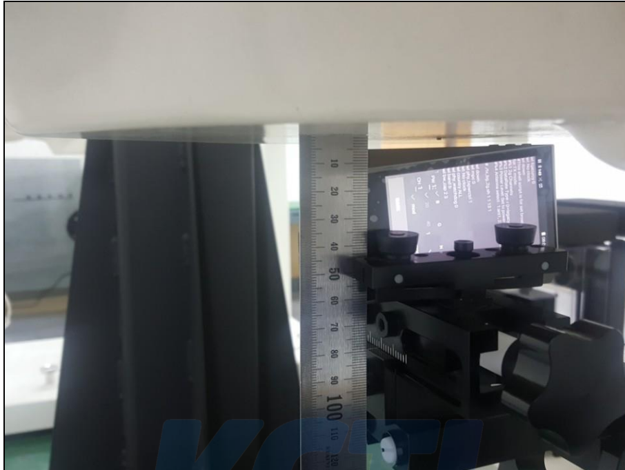
Right (5 mm)