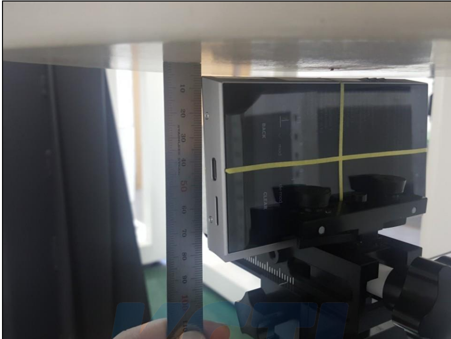
Right (5 mm)