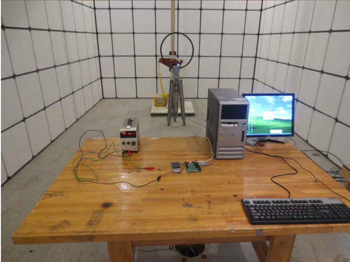
BT_Loop Ant_Under 30MHz