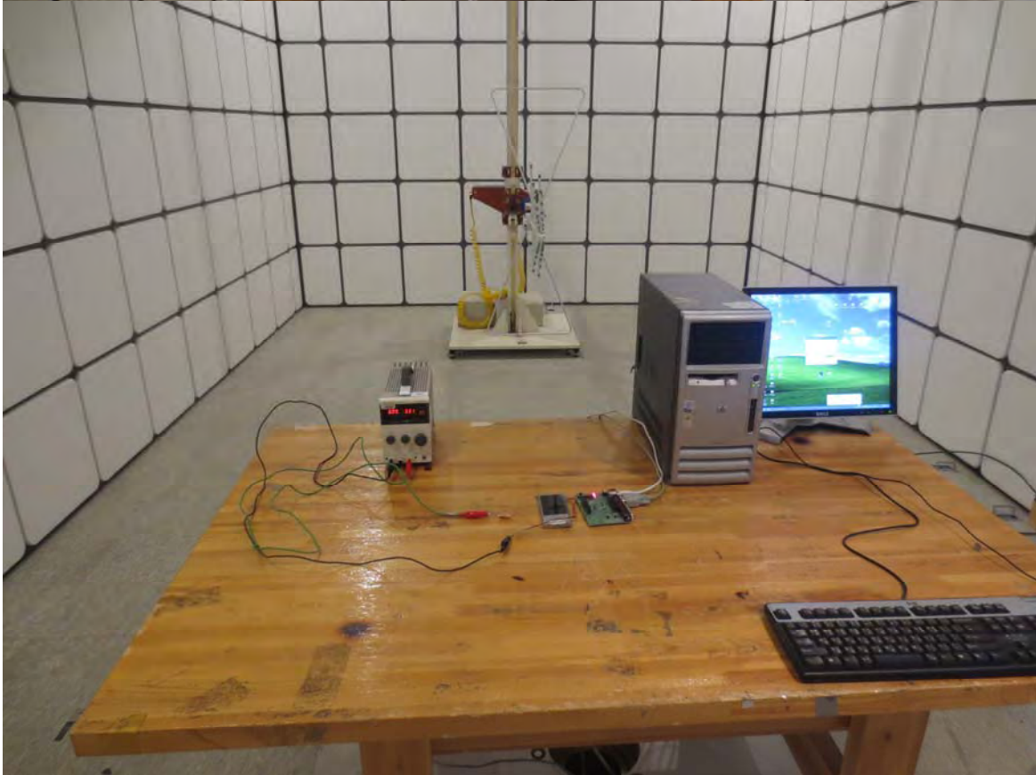
BT_Bi-Log Ant_Under 1000MHz