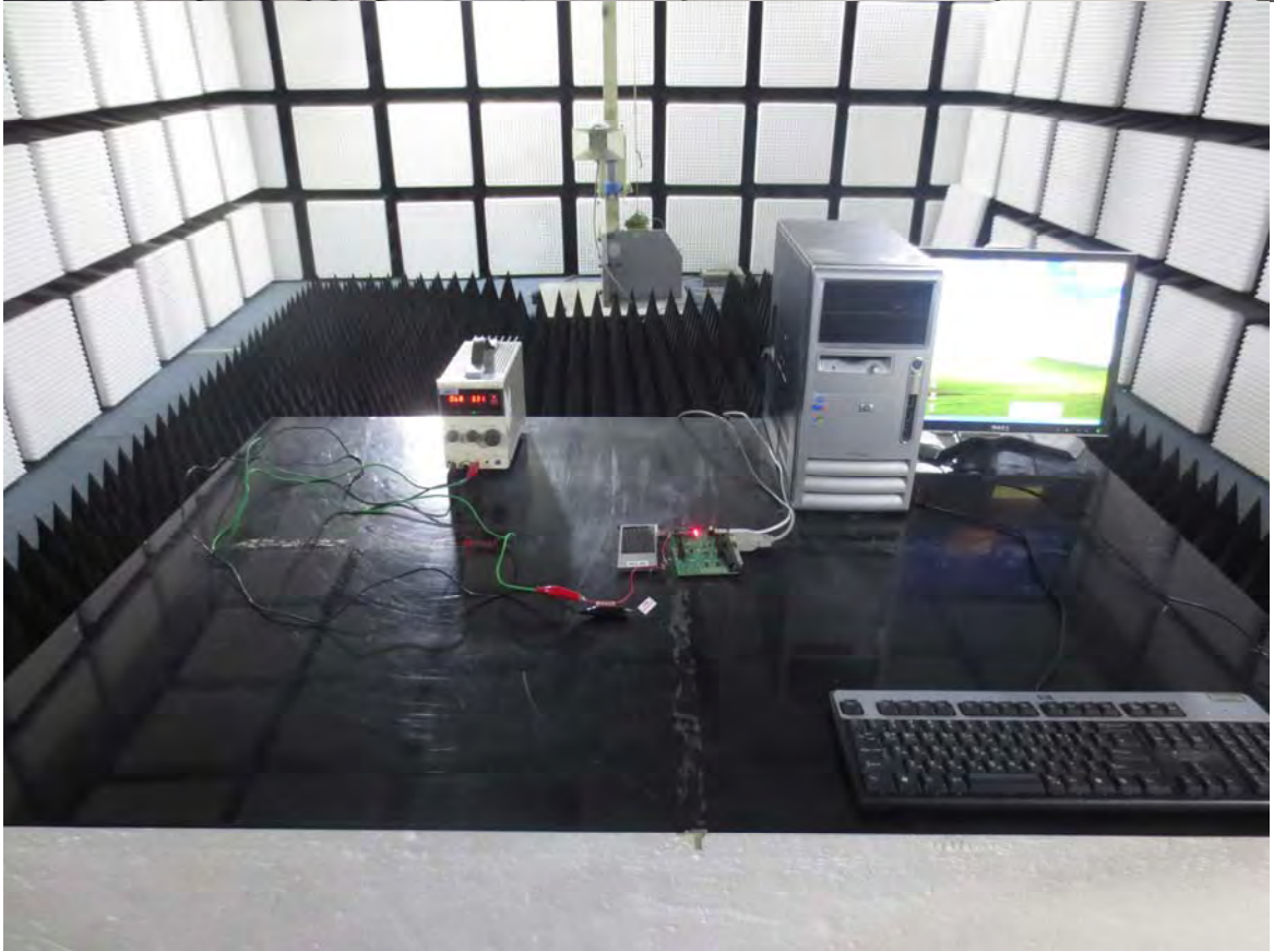
BT_Horn Ant_Above 1GHz