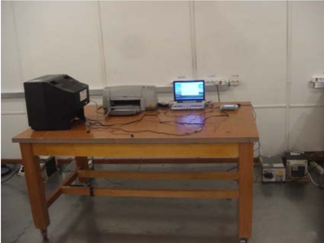
<FRONT PHOTO OF CONTINUOUS DISTURBANCE VOLTAGE >