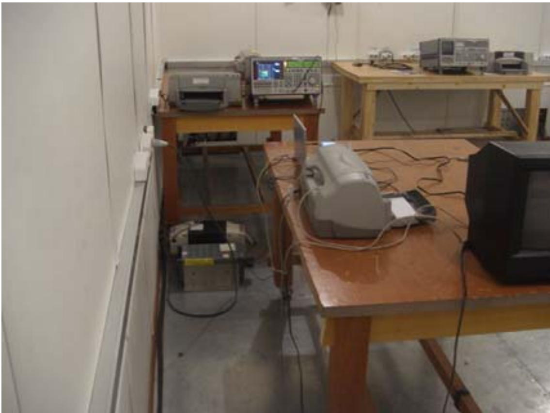
<SIDE PHOTO OF CONTINUOUS DISTURBANCE VOLTAGE >