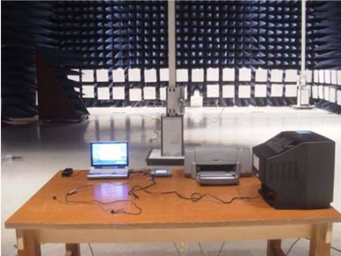
<FRONT PHOTO OF RADIATED DISTURBANCE >