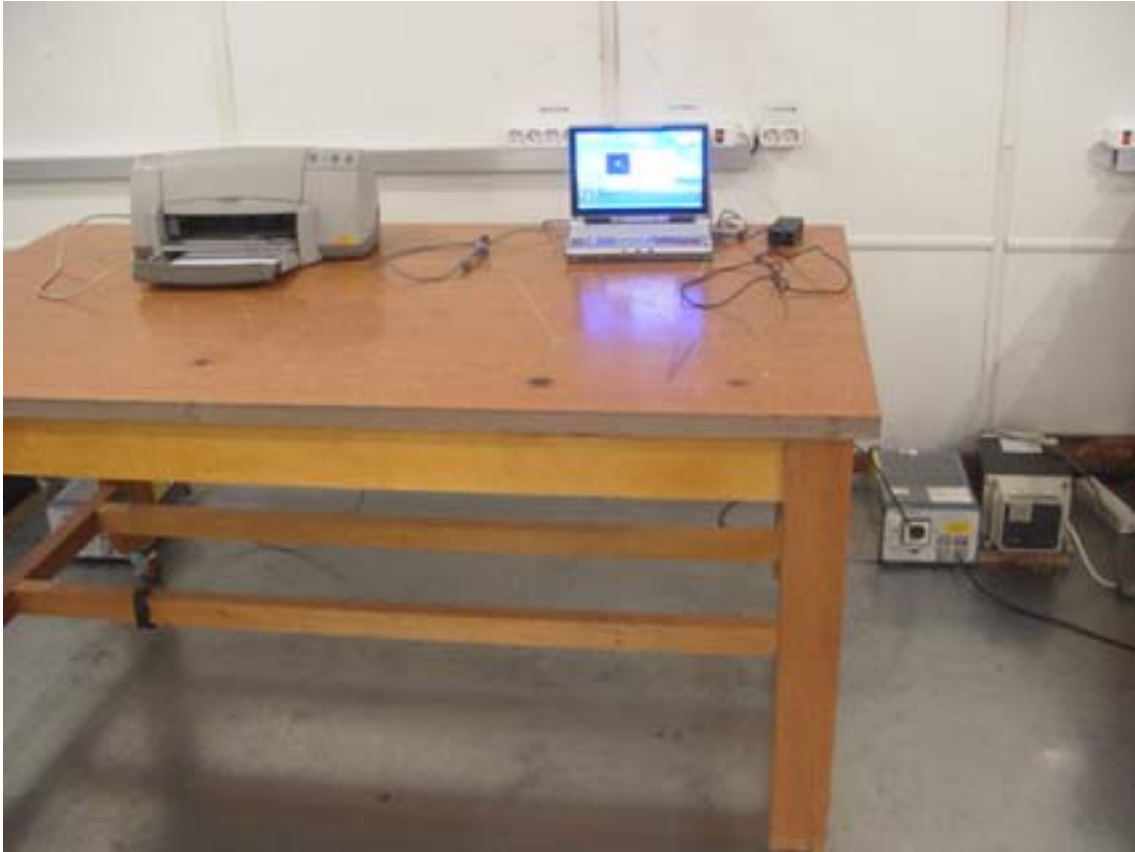
<FRONT PHOTO OF CONTINUOUS DISTURBANCE VOLTAGE >