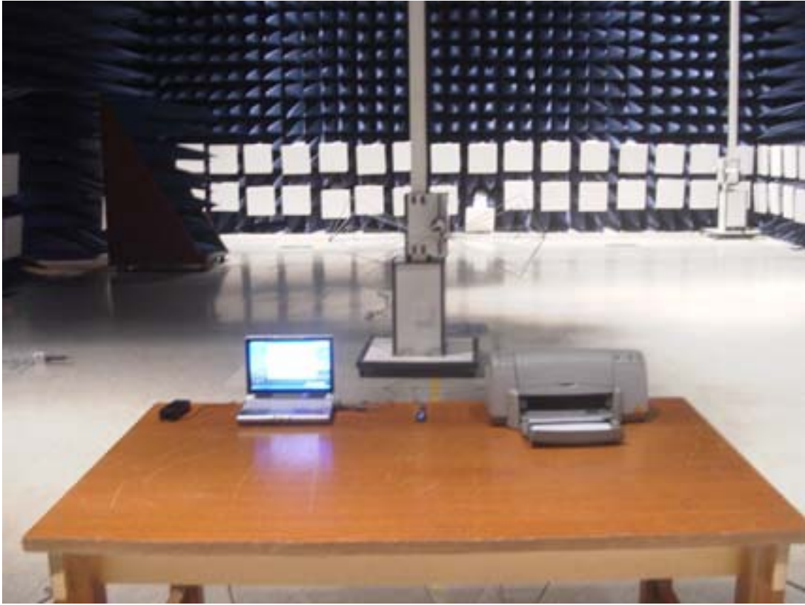
<FRONT PHOTO OF RADIATED DISTURBANCE >