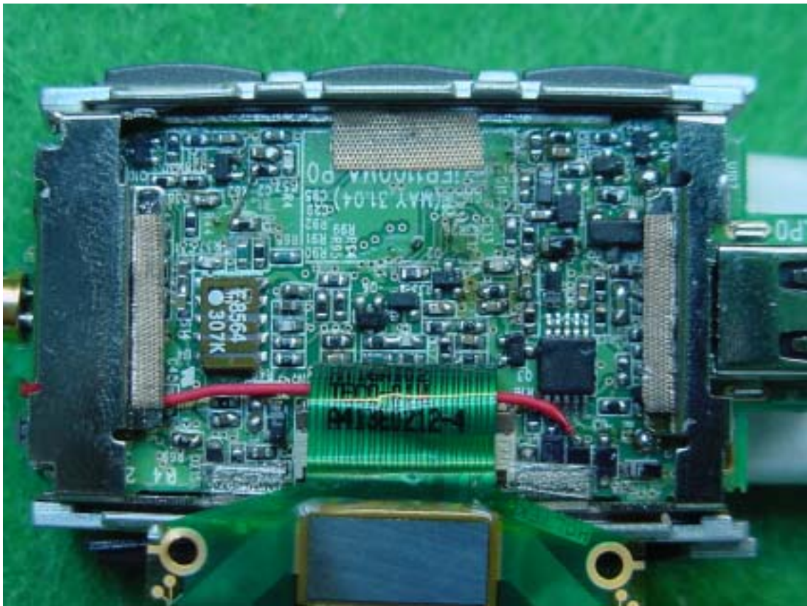
<FRONT SIDE OF MAIN BOARD>