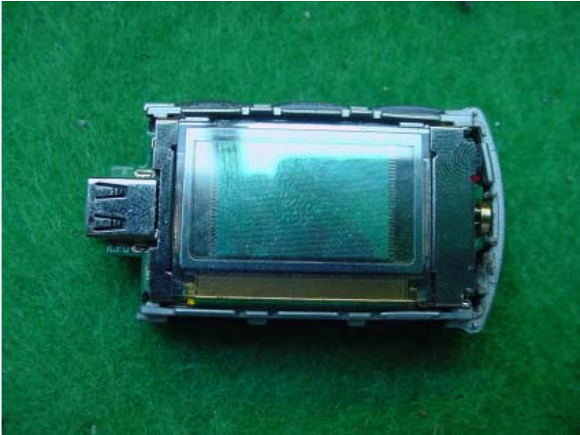
<INNER SIDE OF EUT>