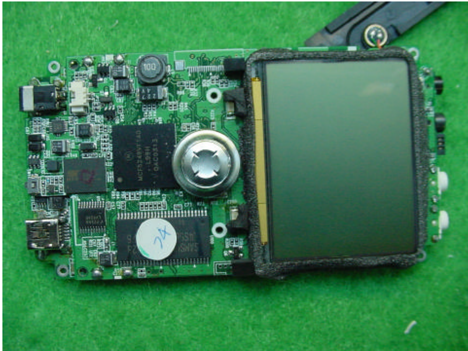
<main board front>