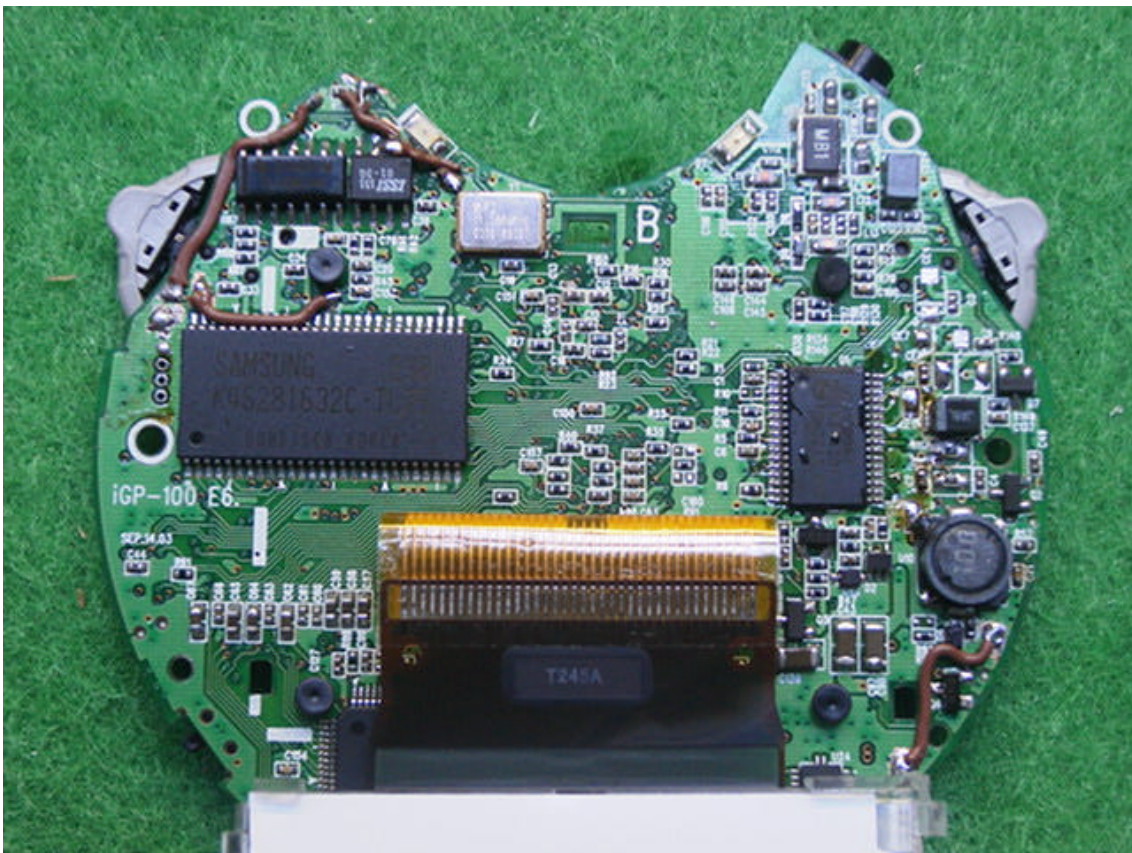
<FRONT SIDE OF MAIN BOARD>