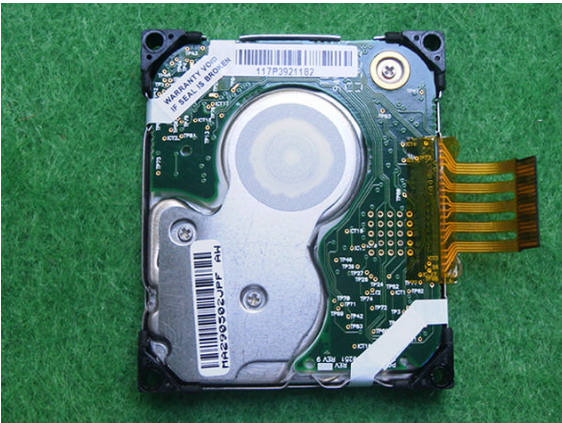
<REAR SIDE OF HDD>