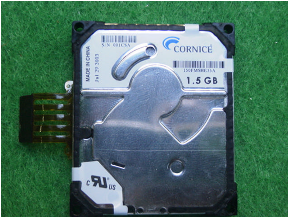
<FRONT SIDE OF HDD>