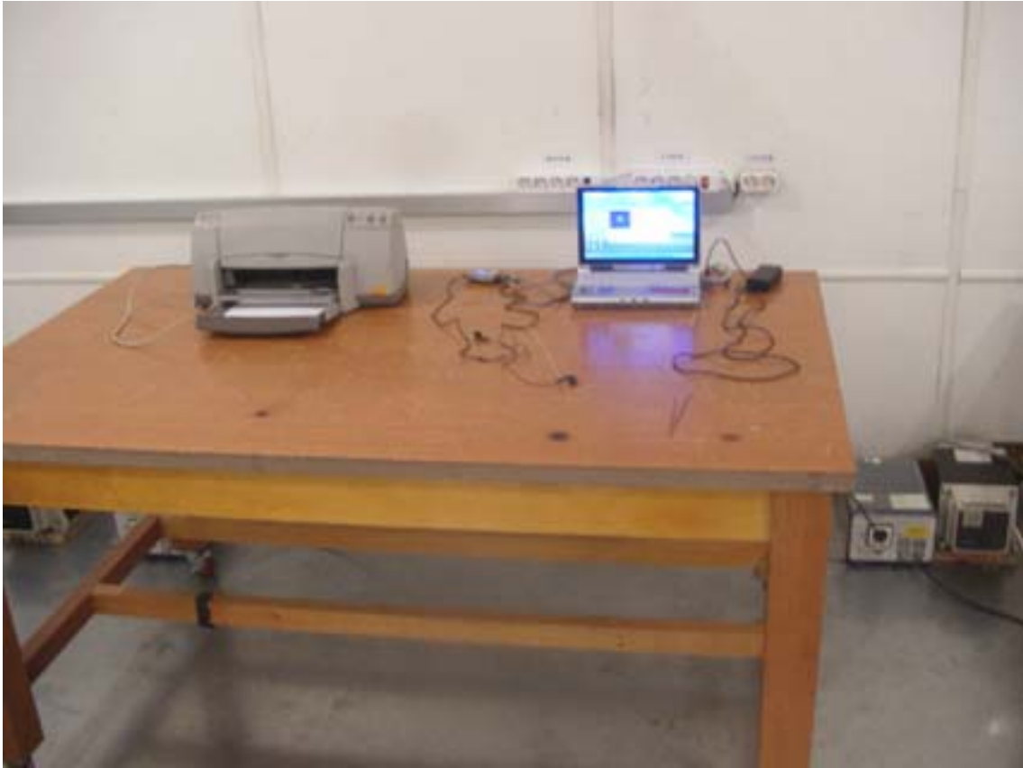
<FRONT PHOTO OF CONTINUOUS DISTURBANCE VOLTAGE >