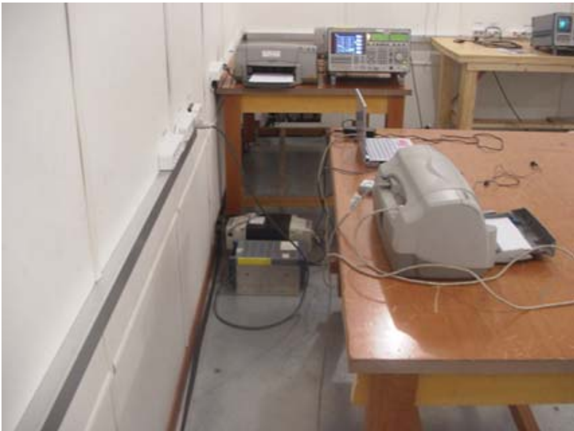
<SIDE PHOTO OF CONTINUOUS DISTURBANCE VOLTAGE >