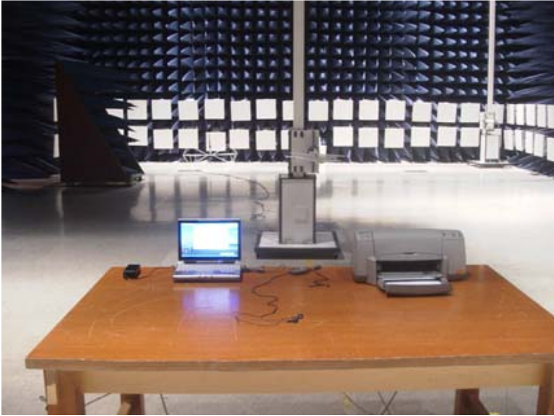
<FRONT PHOTO OF RADIATED DISTURBANCE >