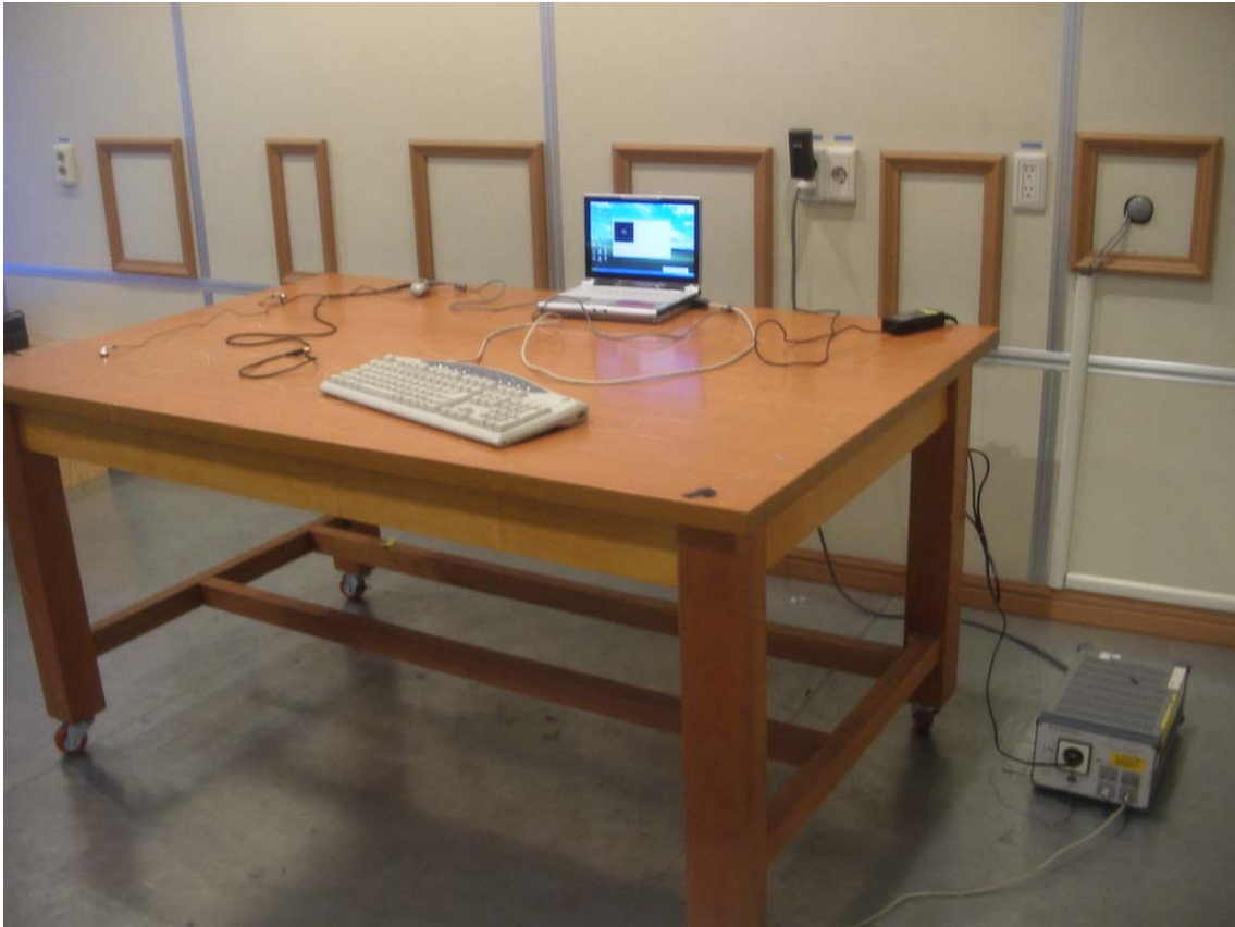
<FRONT PHOTO OF CONTINUOUS DISTURBANCE VOLTAGE >