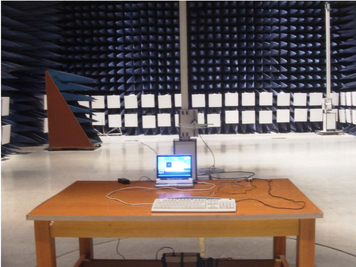
<FRONT PHOTO OF RADIATED DISTURBANCE >