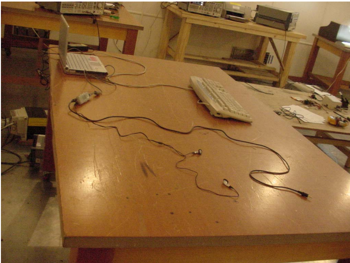
<SIDE PHOTO OF CONTINUOUS DISTURBANCE VOLTAGE >