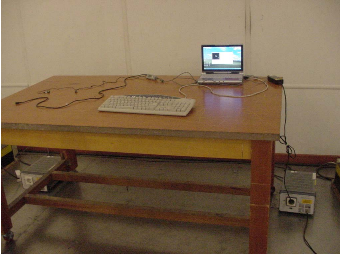
<FRONT PHOTO OF CONTINUOUS DISTURBANCE VOLTAGE >